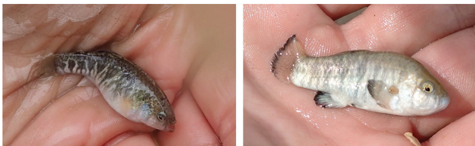
FIGURE 2.—Adult female (left) and male (right) Amargosa River pupfish displaying breeding colors, Death Valley National Park, California, 8 April, 2016 and 11 March 2016, respectively.

The downstream-most location of Amargosa pupfish captured in this study extends the previously recorded geographic range approximately 49 river km to 36° 2' 53.448" N, 116° 47' 59.244" W. Totals of 3,738 and 3,424 Amargosa River pupfish were captured in spring and autumn, respectively, and one western mosquitofish ( Gambusia affinis ) was captured in spring. Mean catch per unit trap was comparable between males and females in spring, but most pupfish captured in autumn were female (78% of total catch). All age-0 fish observed in spring were recorded after 6 April 2016, suggesting an approximate spawning time. Across sample sites and seasons, temperature ranged from 13.3 to 30°C, dissolved oxygen ranged from 0.03 to 11.5 mg/L, pH ranged from 7.3 to 9.9, and depth ranged from 0.01 to 2.00 m.