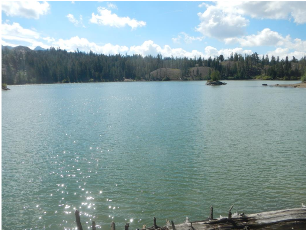
Figure 3. Lower Sunset Lake (B. Ewing, 9/14/2017).