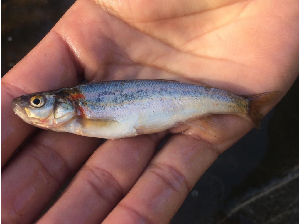
Figure 4. Lahontan redband collected from gillnet at Lower Sunset Lake on 9/14/17 (M. Mamola, 9/14/2017).

Department personnel conducted the Fellers Freel 1995 Visual Encounter Survey (VES) Protocol as modified by the Department to conduct the amphibian survey at Lower Sunset Lake. The VES began at 10:22 and ended at 11:10 on September 14, where the entire lake shoreline was surveyed. Two SNYLF were observed during the survey (Figures 5 and 6). On May 31, 2012, United States Forest Service observed SNYLF at Lower Sunset Lake (CNDDDB 2017). Based on the results of the evaluations completed, a pre-stocking evaluation will not be written to add Lower Sunset Lake to the Department fish stocking list.