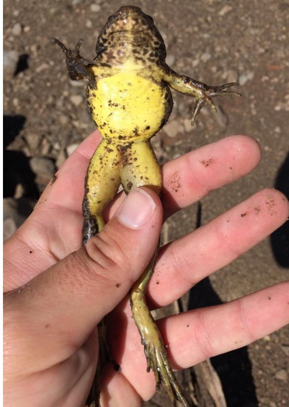
Figure 5. Sierra Nevada yellow-legged frog observed during V.E.S. at Lower Sunset Lake, Alpine Co. (M.Mamola, 9/14/2017).