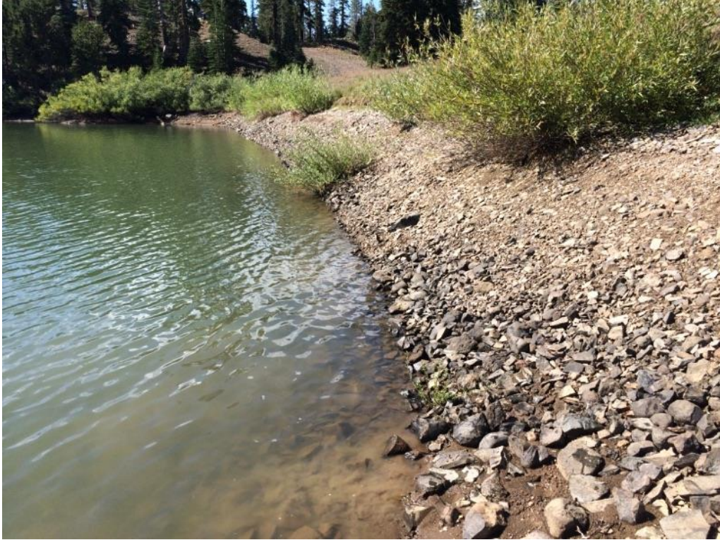
Figure 2. Lower Sunset Lake shoreline (B. Ewing, 9/14/2017).