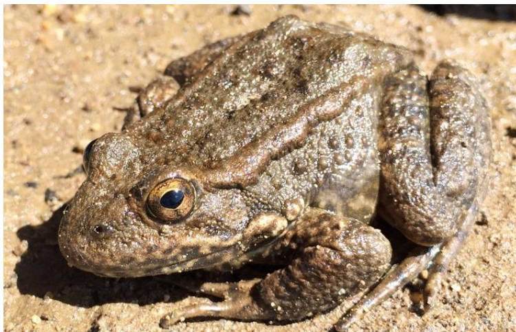
Figure 6. Sierra Nevada yellow-legged frog observed during V.E.S. at Lower Sunset Lake, Alpine Co. (M. Mamola, 9/14/2017).