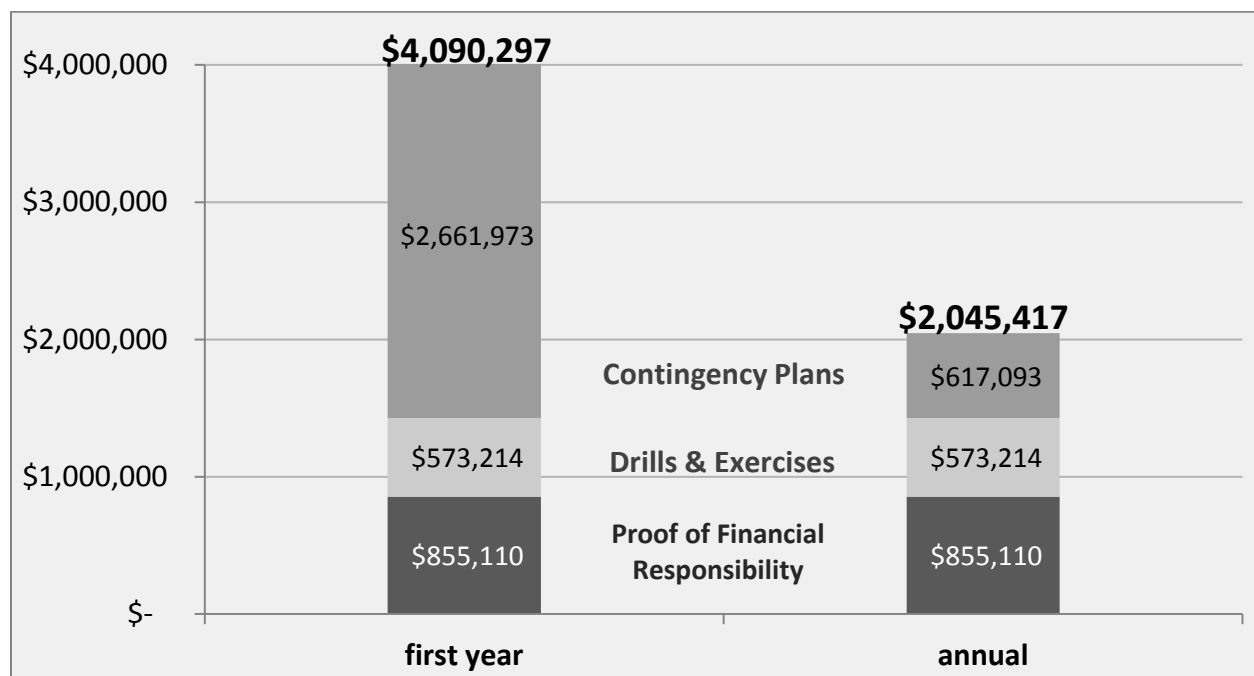
Figure 1: Total Cost of All New Oil Spill Preparedness Regulations

At this time, OSPR is also promulgating regulations for inland facilities regarding: 1) oil spill contingency planning, 2) demonstration of financial responsibility to pay for cleanup and damages, and 3) ratings of oil spill response organizations. The economic impact assessment for each of those requirements is addressed in the Initial Statement of Reasons (ISOR) for each of those rulemakings. Collectively, looking at the costs to comply with all aspects of these four rulemakings (drills and exercises, contingency planning, financial responsibility, and oil spill response organization ratings) across all the affected operators (about 45 facilities), the total cost for industry-wide compliance is expected be about $4 million (Figure 1) in the first year, and $2 million annually in future years. For reasons described in this and other ISORs, this is a high estimate.