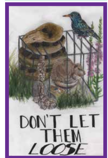
Summer Knight 2nd Place, Grades 9-12