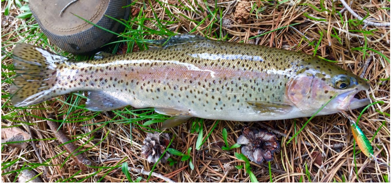
Figure 4. Rainbow trout collected from hook and line sampling at Upper Mosquito Lake on 6/5/18 (M. Mamola, 6/5/2018).

Department personnel conducted the Fellers and Freel 1995 Visual Encounter Survey (VES) Protocol as modified by the Department to conduct the amphibian survey at Upper Mosquito. The VES began at 10:50 and ended at 11:11 on June 5, where the entire lake shoreline was surveyed except the shoreline bordering Highway 4. No SNYLF were observed during the survey. On 8/2/2001 and 7/23/2010, Department staff conducted VES' and observed no amphibians (CDFW HML Database). Based on the results of the evaluations completed, a new pre-stocking evaluation will be written to keep Upper Mosquito on the Department fish stocking list.