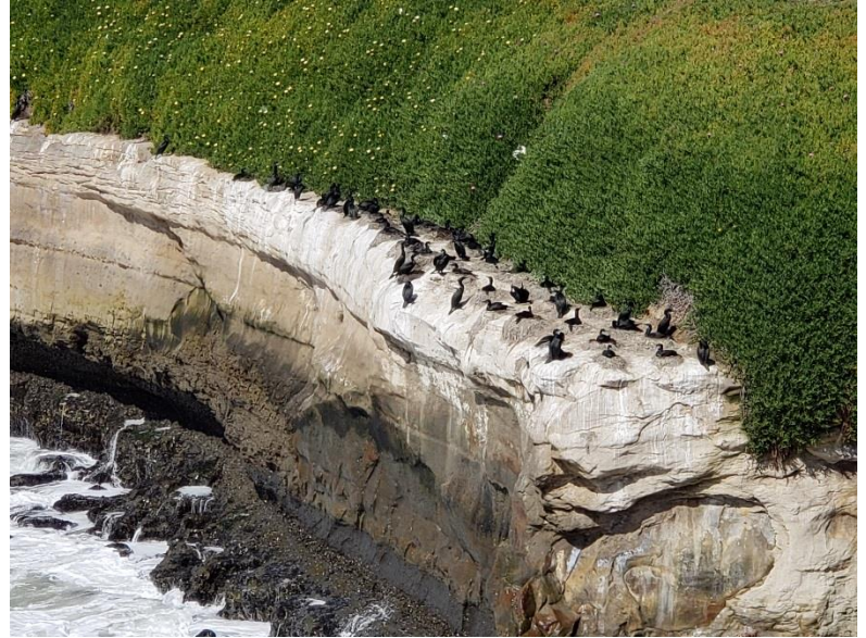
Photo to right: Cormorants nesting on cleared cliff edge at Natural Bridges State Park.

1st Quarter Update: EEF staff visited the project site to April 13 th , 2018. The primary project appears to have been successful. Ice plant has been removed along the cliff providing a ledge which is heavily used by nesting cormorants. No cormorants previously nested at the site. Ice plant was also removed from the bluffs and replaced with native plants.