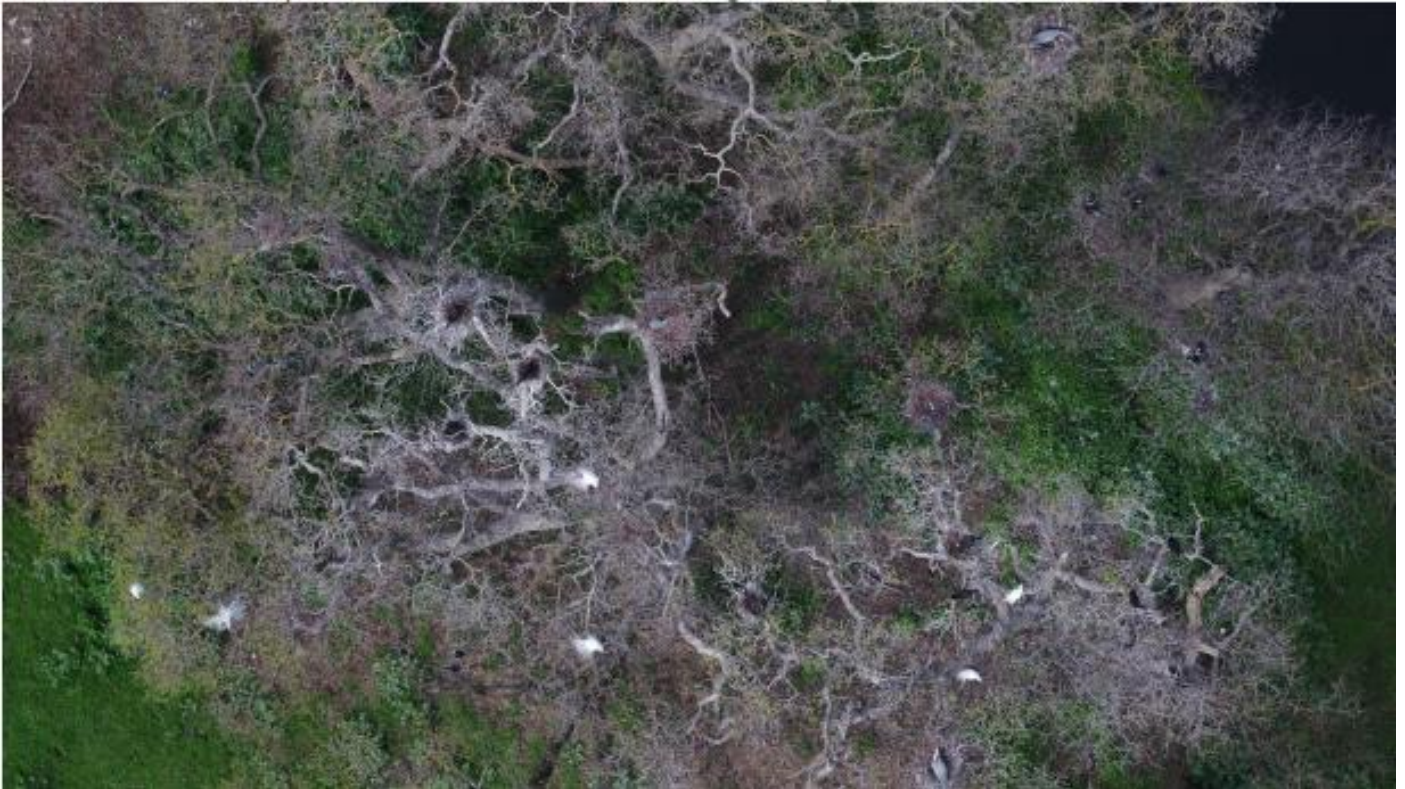
Priority Freshwater Wetlands for Endangered Species at the Cosumnes River Preserve. Photo above: Drone imagery from March 19, 2018 at the Horseshoe Lake rookery showing two eggs in a nest (suspected great blue heron eggs), double-breasted cormorant (Black), Great egret (white with several in courtship displays), great blue heron (gray, white and black near top of canopy), and black-crowned night heron (black and white lower in canopy) in nests. Photo below: Restoration of Valley oak plantings (n=80) along the eastern shoreline of Horseshoe lake at the Consumes River Preserve.