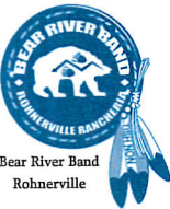
Bear River Band Rohnerville