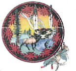
Elk Valley Rancheria