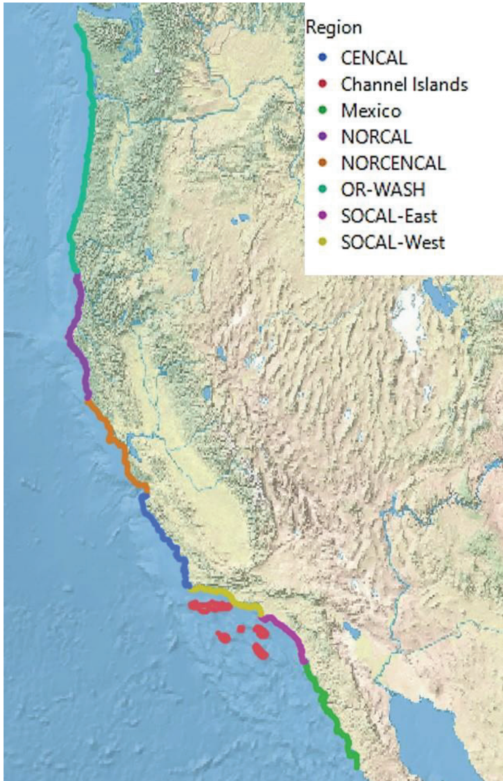
Figure 1. Eight regions assigned for the ROMS MPA network connectivity model