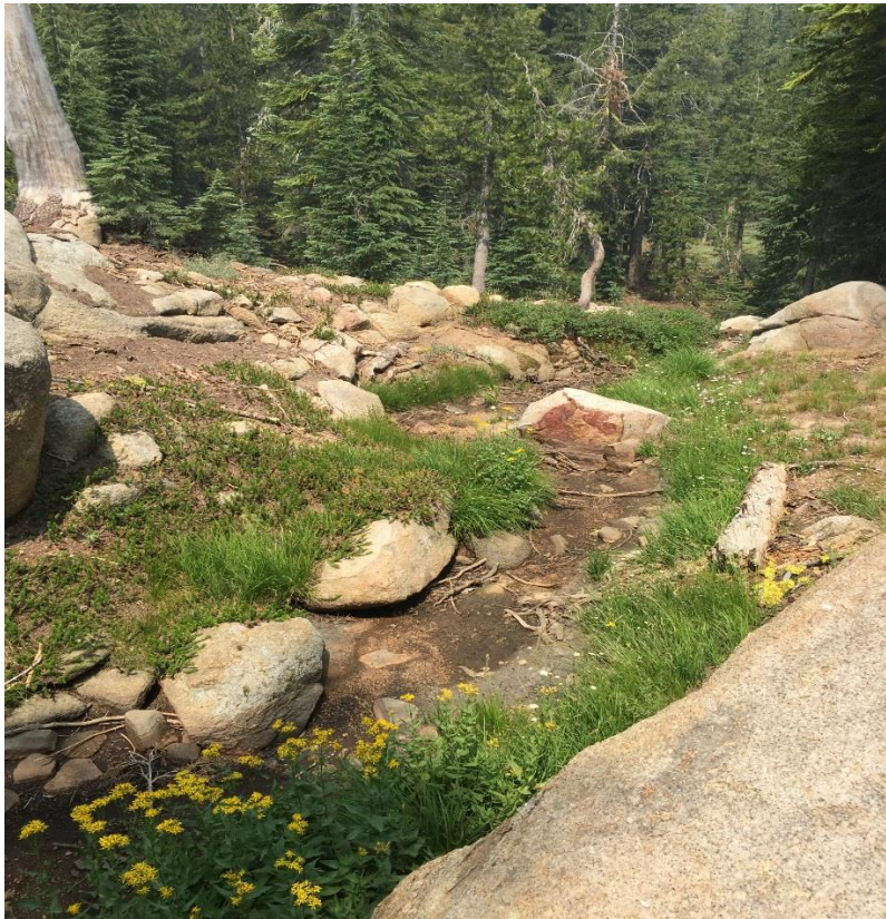
Figure 3. Evergreen Lake Outlet (July 18, 2018)