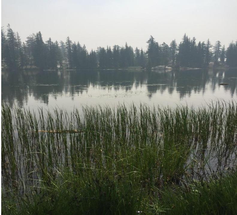
Figure 2. Evergreen Lake, Alpine Co. (July 18, 2018).