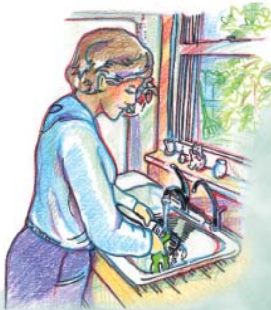
Properly washing water-based paint brushes keeps paint chemicals out of creeks.