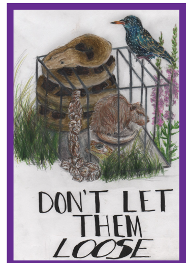
Summer Knight 2nd Place, Grades 9-12 (2017)