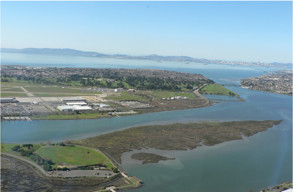
FIGURE 3. —Aerial view of Arrowhead Marsh (foreground) in 1990, which is part of the Martin Luther King Jr. Memorial Shoreline Regional Park in San Leandro Bay and east of the Oakland Airport with Bay Farm Island at the water's edge, the outer Bay and San Francisco in the background.

captured in water 10.7 m deep, which was likely the result of an accidental, premature birth. Of the 101 YOY captured, 87 (86.1%) were found in eelgrass meadows with only 14 (13.9%) found in deeper water (<7 m deep) immediately adjoining eelgrass meadows. All neonate and YOY brown smoothhound sharks were captured by trawl or rod and reel with most neonates captured in May. The majority of juvenile brown smoothhounds ( n = 188 , 87.8%) and adults ( n = 367 , 93.2%) were captured by long-line in deep water <11 m, while nearly an equal number of juveniles ( n = 26 , 12.2%) and adults ( n = 27 , 6.8%) were captured by trawl or rod and reel in eelgrass meadows generally in May and June. No brown smoothhound sharks were captured south of the Dumbarton Bridge nor in marsh sloughs or channels. Thus eelgrass meadows north of the bridge were found to be the most important primary nursery habitat for neonate and YOY brown smoothhounds.