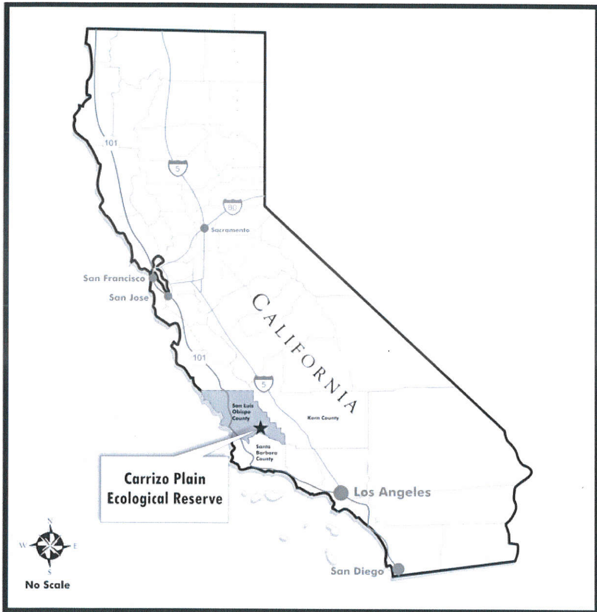
Figure 1 – State Location