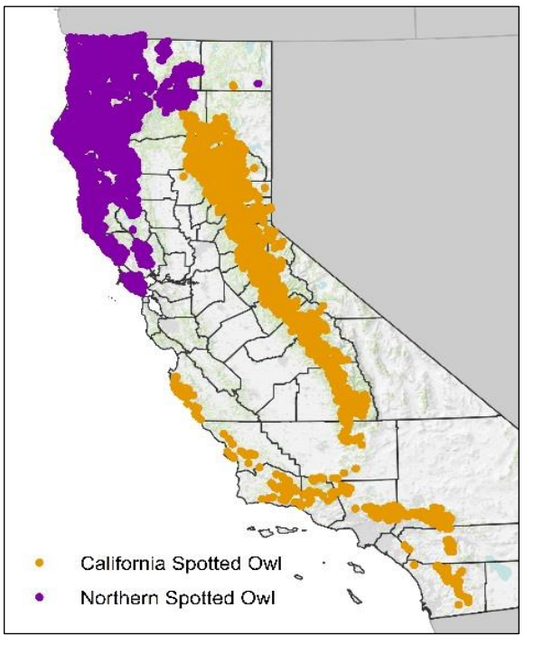
Figure 1. Statewide distribution of NSO and CSO data contained in the SPOWDB.

The SPOWDB was created in 1973 by Senior Environmental Scientist and spotted owl expert, Gordon Gould. Around this time, spotted owl surveys were commencing statewide, in part with CDFW funding, in response to noted population declines. The first version tracked CSO and NSO observations and territories using 4x6 notecards. Over time, the database progressed through a number of formats, all of which, until recently, contained a Territories<sup>*</sup> table with activity center locations and a related Observations table containing detailed information about individual observations. In 2012, the Territories and Observations tables were merged to create a single table consisting of activity centers (ACs) and all other reported observations, which remains as the database format today. See the Contents and Activity Center sections for definitions of "observation" and "activity center".