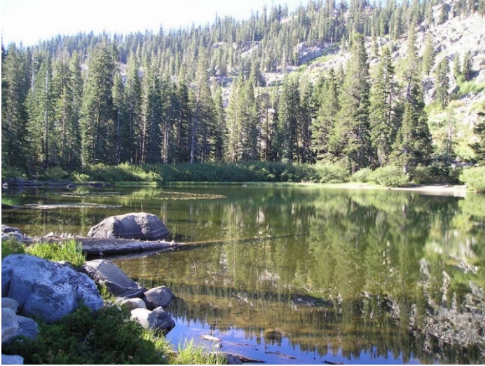
Figure 1. Shoreline view of Cody Lake looking south (8/25/2008).