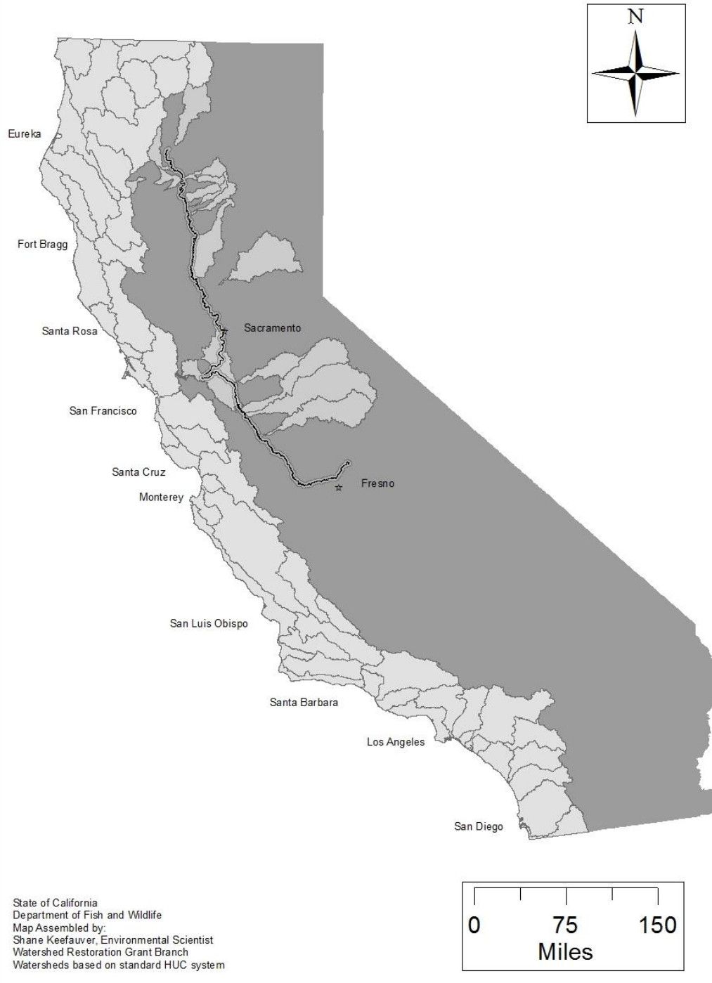
Map 1: Area covered by FRGP