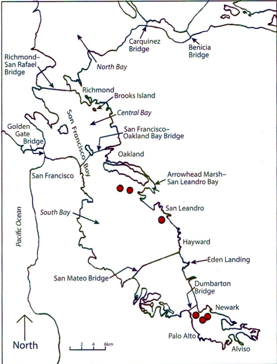
Figure 1. Map of the study area of San Francisco Bay with all catch events (red circles) in this study restricted to South San Francisco Bay and close to known parturition or mating sites.

Between 1970 and 2001, data collection was conducted monthly primarily between the San Francisco Bay Bridge (37.800 N, 122.3667 W) and the entrance of Alviso Slough (37.450 N, 122.017 W) at the south end of San Francisco Bay (Figure 1). There were 224 catch events (one technique, location, date, and time) using long-lines ( n = 146 ), rod and reel ( n = 36 ), and otter trawl ( n = 42 ) (Russo 2019).