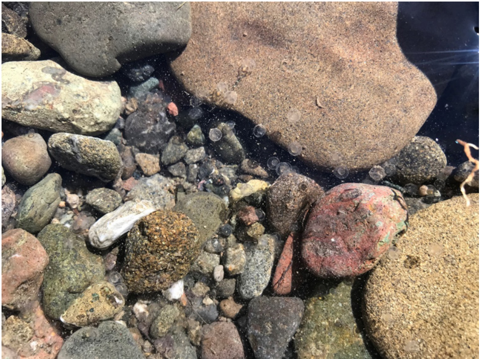
Figure 3. Representative photographs of negatively buoyant Clear Lake Hitch eggs and the irregular rocky substrate into which they settled. For reference, fertilized egg diameters were approximately 1.0–2.0 mm (Swift 1965).