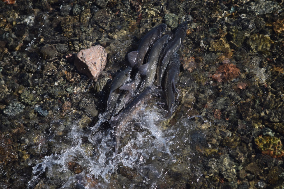
Figure 4. Two representative examples of Clear Lake Hitch spawning behavior. Top panel: Two smaller males positioned alongside a single larger female immediately prior to a spawning burst. Bottom panel: Typical spawning burst behavior whereby several males are attempting to fertilize eggs broadcast by a female. Additional photographs and video documenting behavior are available at https://doi.org/10.5066/P90BNFFL