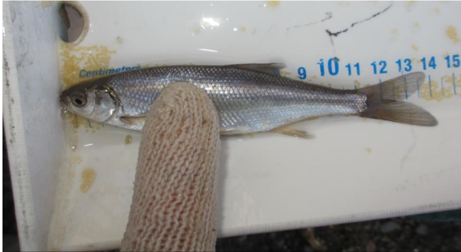
Figure 2. Juvenile HCH-C being measured (S. Newton, 3/13/14).

estimate, and numbers of HCH-C collected would be calculated.