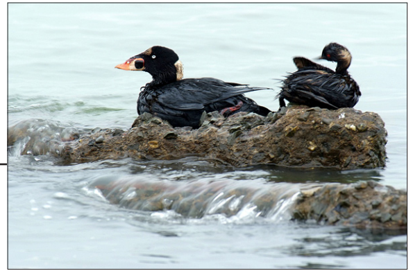
Oiled Surf Scoter and Eared Grebe.

A s a result of November 2007 M/V Cosco Busan oil spill that released 58,000 gallons of fuel oil into San Francisco Bay, representatives from state and federal agencies are working together with the responsible party to assess the ecological injuries and human use losses from the incident. This process is known as a natural resource