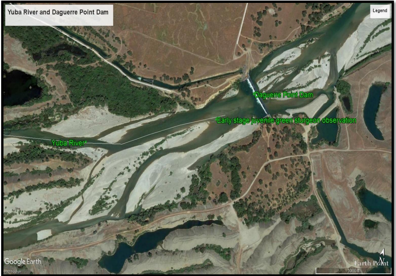
Figure 1. Yuba River and Daguerre Point Dam. Egg mat sampling was conducted in the pool immediately downstream of the dam.