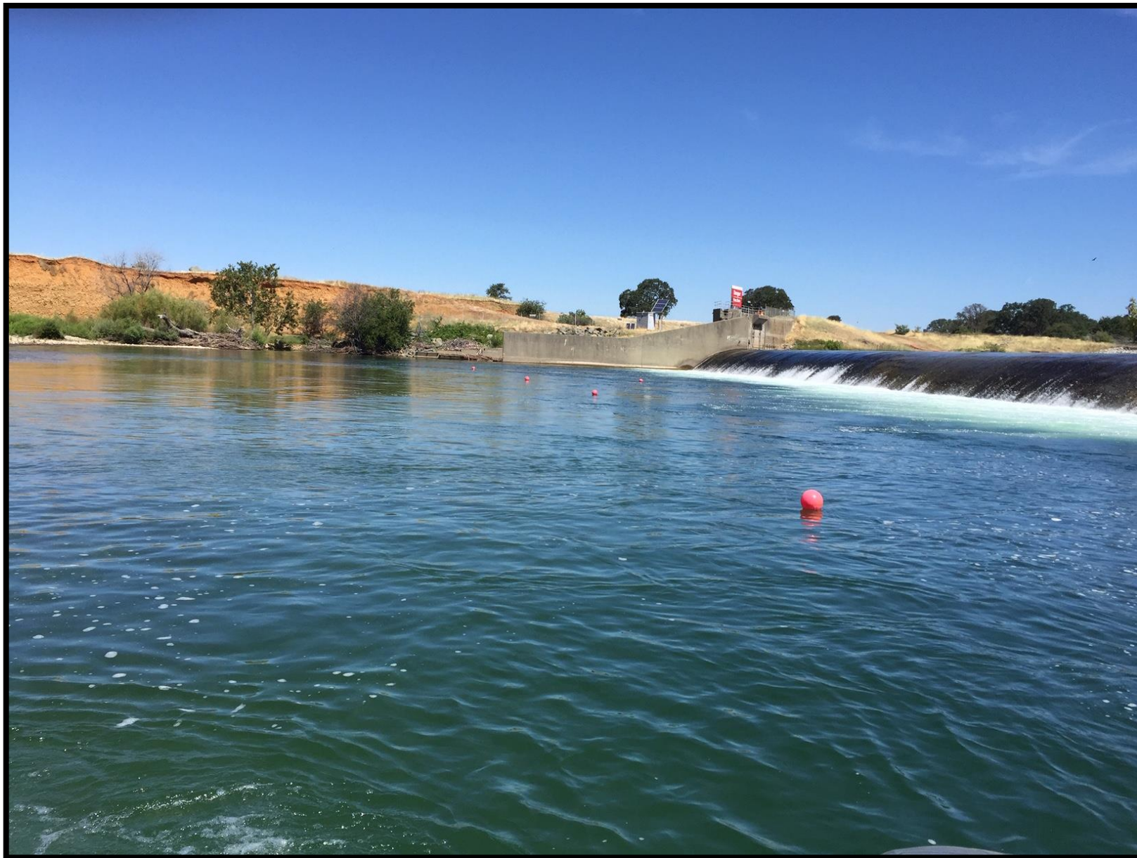
Figure 2. Daguerre Point Dam Pool egg mat locations. Mats are approximately three-four meters upstream of buoys.