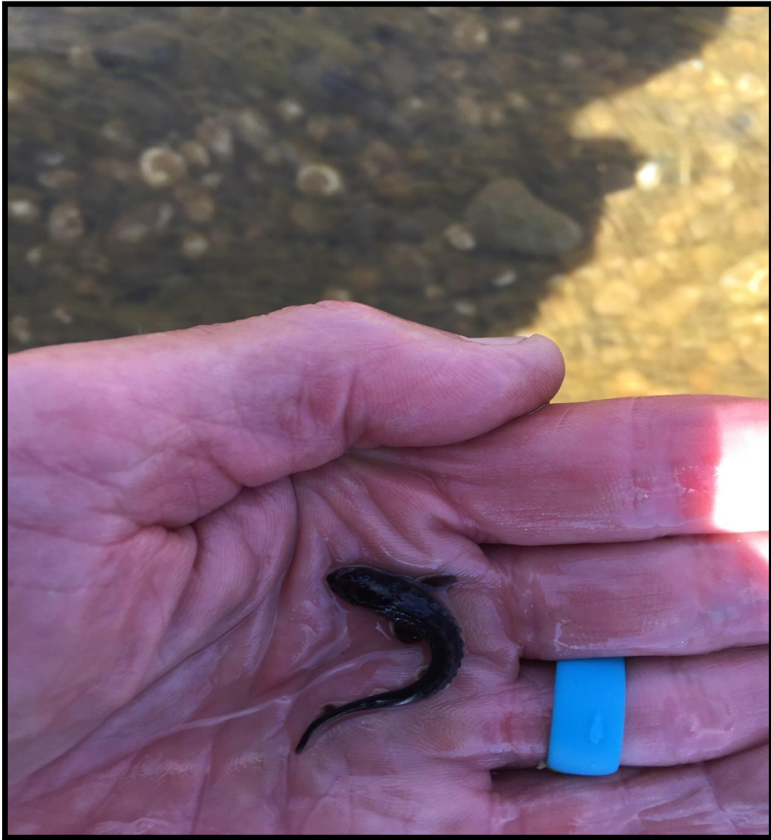
Figure 3. Early stage juvenile green sturgeon captured 19 August 2019 approximately 200 m downstream of Daguerre Point Dam.