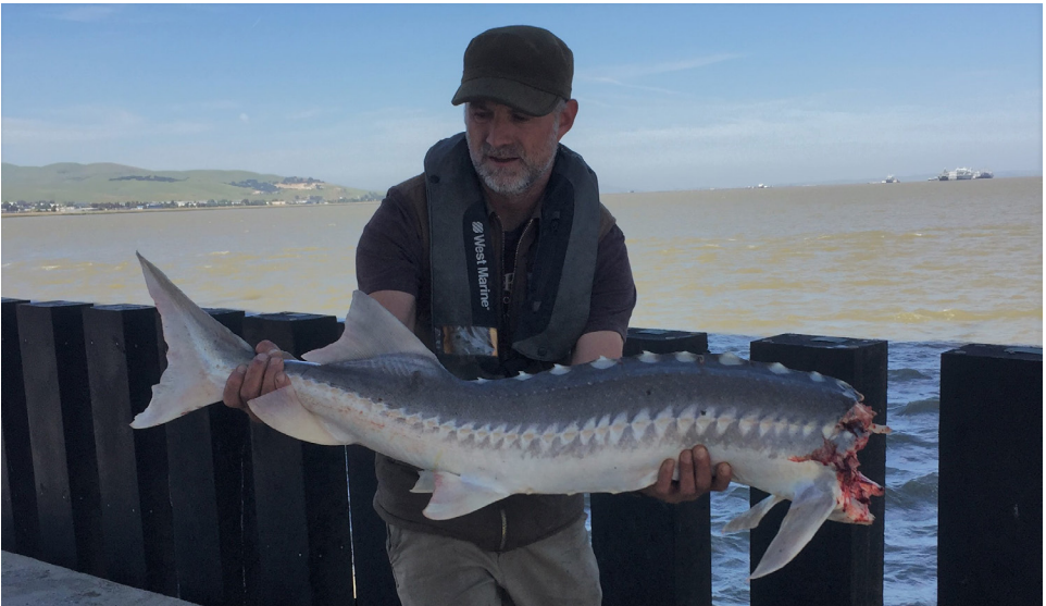
Figure 3. Lateral view of the white sturgeon with noticeable lacerations and trauma to the head region.