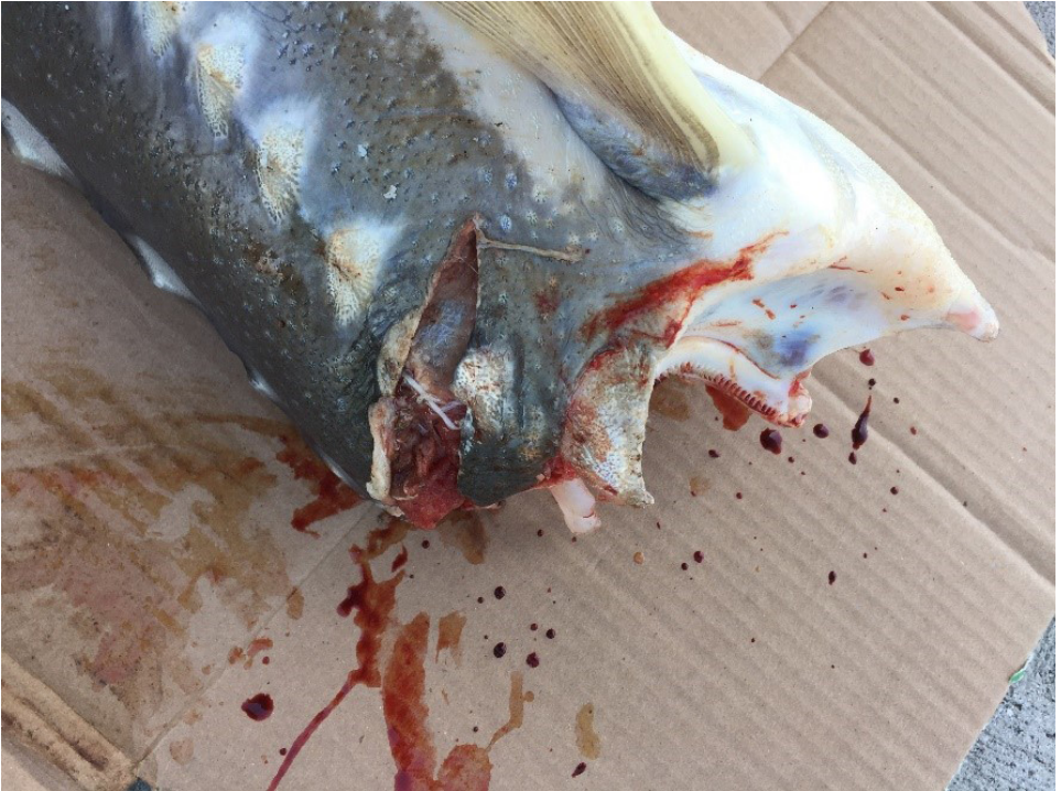
Figure 2. Close up of wound with noticeable slice marks presumably caused by the vessel's propeller.