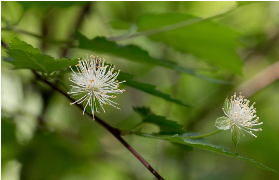
Photo of Neviusa cliftonii

Prepared by California Department of Fish and Wildlife