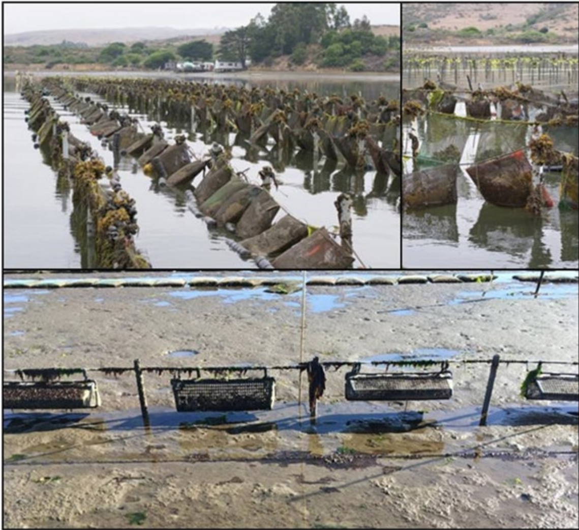
Figure 2-7. Intertidally suspended lines with floating bags (top, left and right) and hanging non-floating baskets (bottom).