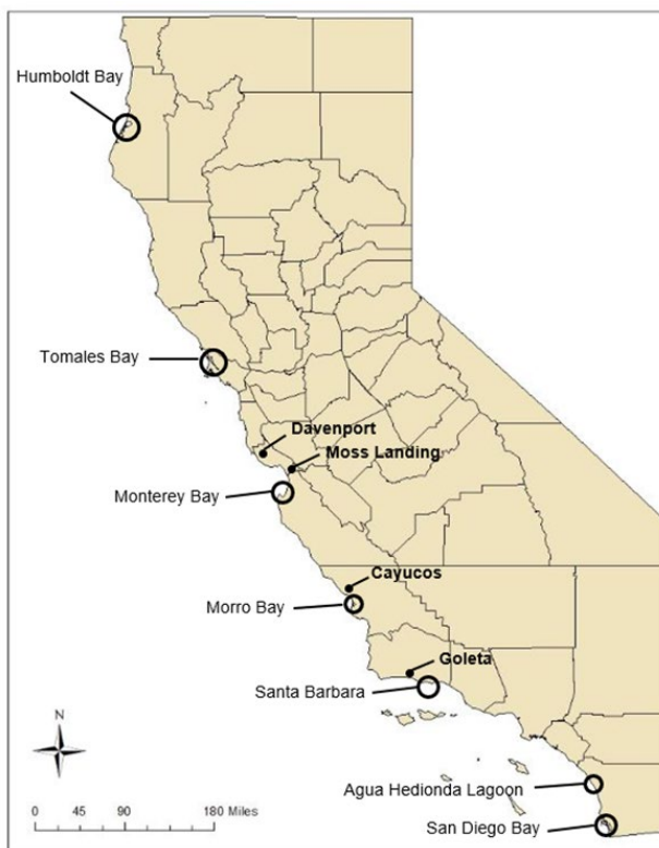
Figure 2-1. Locations of commercial marine aquaculture facilities in California. Open circles show locations with facilities in state waters and closed circles show land-based facilities. Many facilities within state waters also have associated land-based facilities.

Marine aquaculture of shellfish and seaweed occurs throughout the state of California in both coastal waters and private land-based facilities (Figure 2-1 and Table 2-1). Although the majority of operations are within coastal waters, there are three active land-based facilities growing shellfish and/or seaweed for commercial sale and consumption, with a fourth long-standing operation in Cayucos closing business in early 2020. A total of 4,960 acres of California public tidelands are utilized for marine aquaculture, which are leased out by the Commission via a state water bottom lease, unless the tidelands are previously granted or privately owned by other entities.