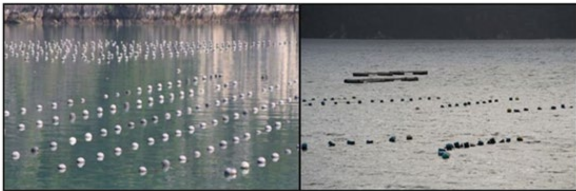
Figure 2-9. View of subtidal longlines from a distance.