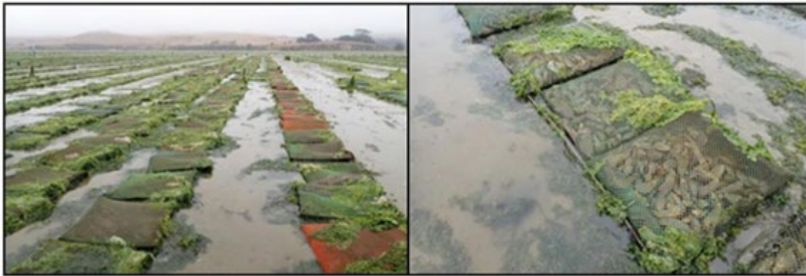
Figure 2-4. Bags on bottom attached to staked lines; bags are attached to lines using coated wire and closed using zip ties.

This culture method dominates oyster production in California due to its suitability to the extensive intertidal areas in most leases and its low-cost relative to culture methods which require more structural components. Oysters grow well, are relatively easy to handle, allow boats to pass over easily during high tide, and can be walked through relatively easily during low tide.