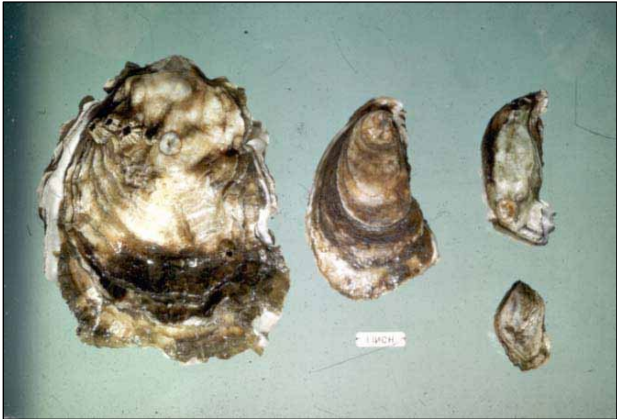
Figure 2-3. Species of oysters grown in California. Left, Pacific Oyster; center, Eastern Oyster; upper right, Kumamoto Oyster; lower right, Olympia Oyster.

The first commercial oyster beds were established in San Francisco Bay in about 1851 when mature native (Olympia) oysters were shipped from Shoalwater Bay, Washington (Willapa Bay) and later from other bays in the U.S. Pacific Northwest and Mexico. Market demand for a larger half-shell product stimulated experiments in transporting the Eastern Oyster from the Atlantic states to the Pacific coast. Cool summer water temperatures, however, prevented successful natural reproduction of the Eastern Oyster. Soon after completion of the transcontinental railroad in 1869, shipments of Eastern Oyster seed were made and transplanted in San Francisco Bay for further growth, marking the beginning of actual oyster raising in California. However, with California's population and industrial growth came a degradation of water quality in San Francisco Bay, and by 1939 the last of the San Francisco Bay oysters were commercially harvested (Barrett 1963).