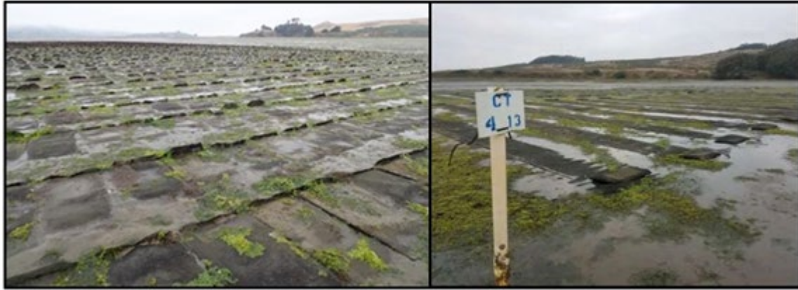
Figure 2-5. Left: Embedded bottom bags used for clam culture. Right: Clams seeded into the mud are covered with mesh netting until they can be raked out at harvest time.

several years of grow-out time, the bags are removed from the mud and gently shaken to remove sediment. To harvest clams that are directly seeded into the sediment, rakes or hydraulic dredges must be used. Only one company in California still uses in-ground clam culture. Because of the increased substrate disturbance caused by harvesting with the hydraulic rake, this method will be phased out in the next few years.