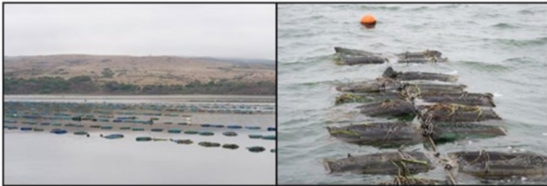
Figure 2-8. Subtidal longlines using bags with floats attached to keep the bags at the surface.

suspension of stacked trays or cages of shellfish that hang vertically beneath the longline (Figure 2-10). A variation of this method is used for mussels, which utilizes a specialized “fuzzy mussel rope” with a higher surface area for mussel settling and culturing. Fuzzy rope containing cultured mussels is hung in long repeating loops suspended from evenly spaced attachment points to the submerged longline. The submerged longline can be maintained at a constant water depth, approaching 30 feet deep in some nearshore farms, using a series of submerged floats and counterweights.