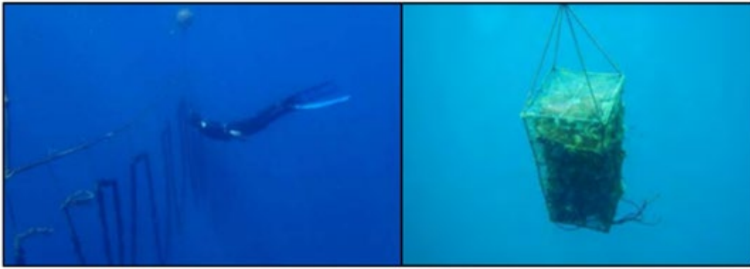
Figure 2-10. Submerged longline variations: mussel longline and stacked cages hanging from a submerged longline.