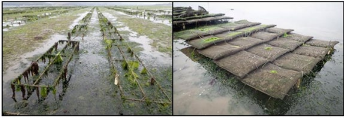
Figure 2-6. Rebar racks and Vexar mesh oyster bags, suspended above substrate using PVC. Bags may be arranged in an overlapping fashion to absorb wave energy more effectively.

This method is commonly used in California for several reasons. Logistically, the raised containers can be accessed by boat and may be easier to handle than bottom containers. In addition, the rack structure allows containers to be placed off-bottom in softer sediments where the bottom container method is not an option due to a high burial risk.