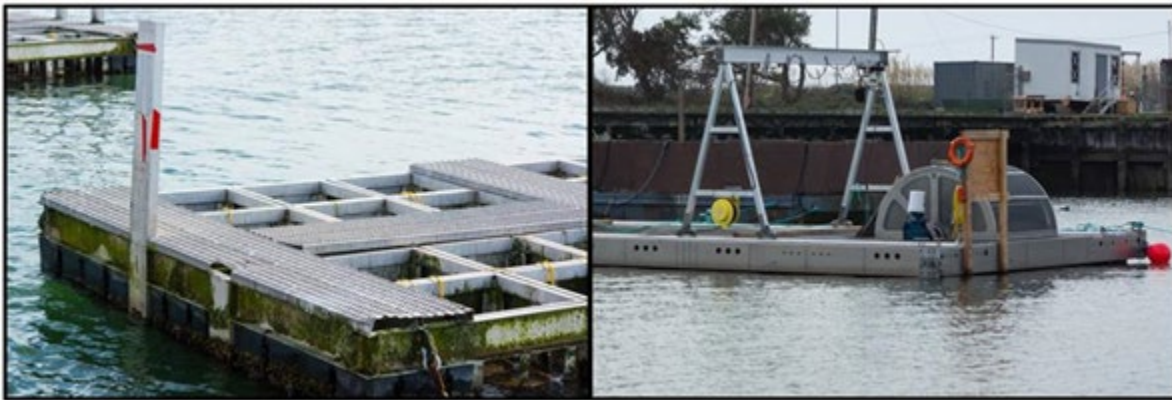
Figure 2-12. Raft modification: floating upwelling raft system. Upwelling containers hang in compartments on floating rafts (left) with a large paddle wheel directing nutrient rich water through containers (right).

A popular modification of this method, the floating upwelling raft system (FLUPSY), is used to grow shellfish seed quickly to the appropriate size for planting. On a FLUPSY, a series of upwelling containers hold small oyster seed while an underwater paddle wheel circulates algae and nutrient-rich waters through the screened bottoms of each container (Figure 2-12). Floating rafts support the upwelling containers and keep the shellfish several feet below the water surface. FLUPSYs are typically installed adjacent to piers and held in place using mooring lines and chain as well as anchored to the seafloor.