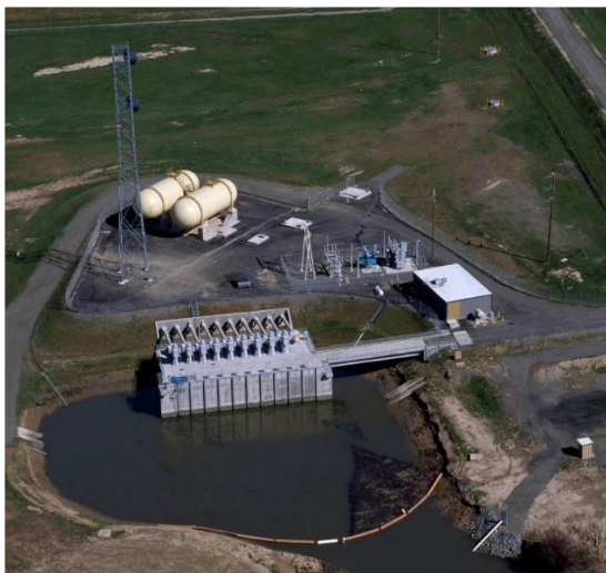
Figure 1. Aerial view of Barker Slough Pumping Plant.

The BSPP diverts water from Barker Slough into the North Bay Aqueduct (NBA) for delivery to Napa and Solano counties. The NBA intake is located approximately 16 km from the mainstem Sacramento River at the end of Barker Slough. In accordance with salmon screening criteria, each of the aqueduct's 10 pump bays are individually screened with a positive barrier fish screen consisting of a series of flat, stainless-steel, wedge-wire panels with a slot width of 0.238 cm. This configuration is designed to exclude and prevent the entrainment of fish measuring approximately 2.54 cm or larger. The bays tied to the two smaller units have an approach velocity of about 0.2 foot per second (ft/sec). The larger units were designed for a 0.5 ft/sec approach velocity, but actual approach velocity is about 0.44 ft/sec. The screens are routinely cleaned to prevent excessive head loss, thereby minimizing increases in localized approach velocities.