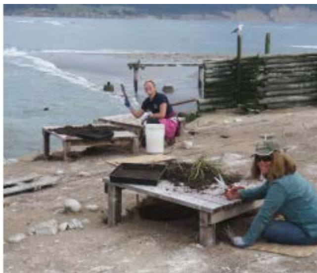
Photo to right: UCSC and community volunteers planting under HEAPs

1st Quarter Update: Project crews managed three island visits this quarter prior to shelter in place restriction. The rainwater system installed in fall reached full capacity which allowed for planting of native Salt Grass starts. Over three island visits staff and volunteers placed 1,100 plants underneath the Habitat Enhancement Protection Platforms (HEAPs).