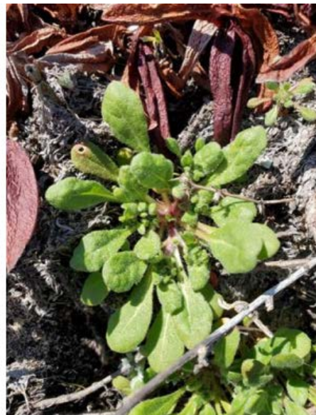
Photo above left: Summary of results of pre-restoration (Fall 2019) and first year restoration (Spring 2020) vegetation surveys. Photo above right: Native Chorizanthe coming up between dying iceplant