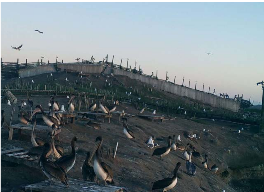
Photo to right: Game camera image demonstrating Brown Pelicans on HEAPs

Planting efforts and monitoring planned for May are currently delayed. Project managers hope to pursue a modified schedule, perhaps with essential staff only, in the future. In the interim, analysis of game camera images to monitor Brown Pelicans will be prioritized.