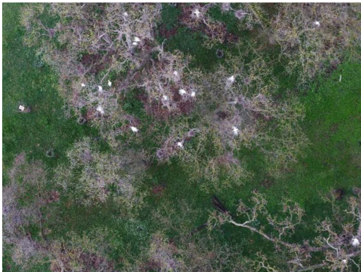
Photo above: Image of great egret rookery on March 8, 2020 taken during drone survey. This is around the time when great egrets begin accumulating more in the rookery.

1st Quarter Update: The construction phase is complete, invasive species treatments are ongoing, and the project is on schedule. During this quarter post-restoration surveys were partially completed. Approximately six acres of weed treatments for thistles and poison hemlock occurred under rookery trees. Galt Joint Union School District helped preserve staff plant more oak trees in January. Due to the COVID-19 outbreak, all volunteer and staff monitoring activities were suspended starting March 13, 2020. Final monitoring may not occur due to “stay-at-home” orders.