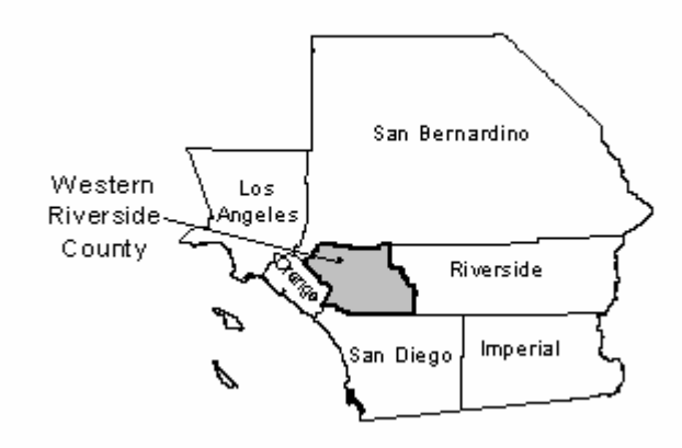
Figure 1. Study area in Western Riverside County within Southern California, showing ecological subsections. The subsections in the inset are consistent with the US Forest Service ecological subregions (Miles and Goudey 1997) and are separated by thick black lines.