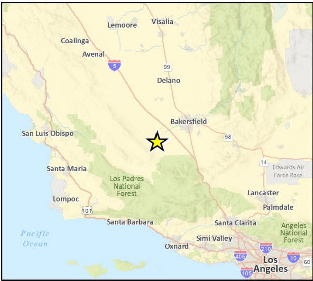
Fig 1 Regional Location