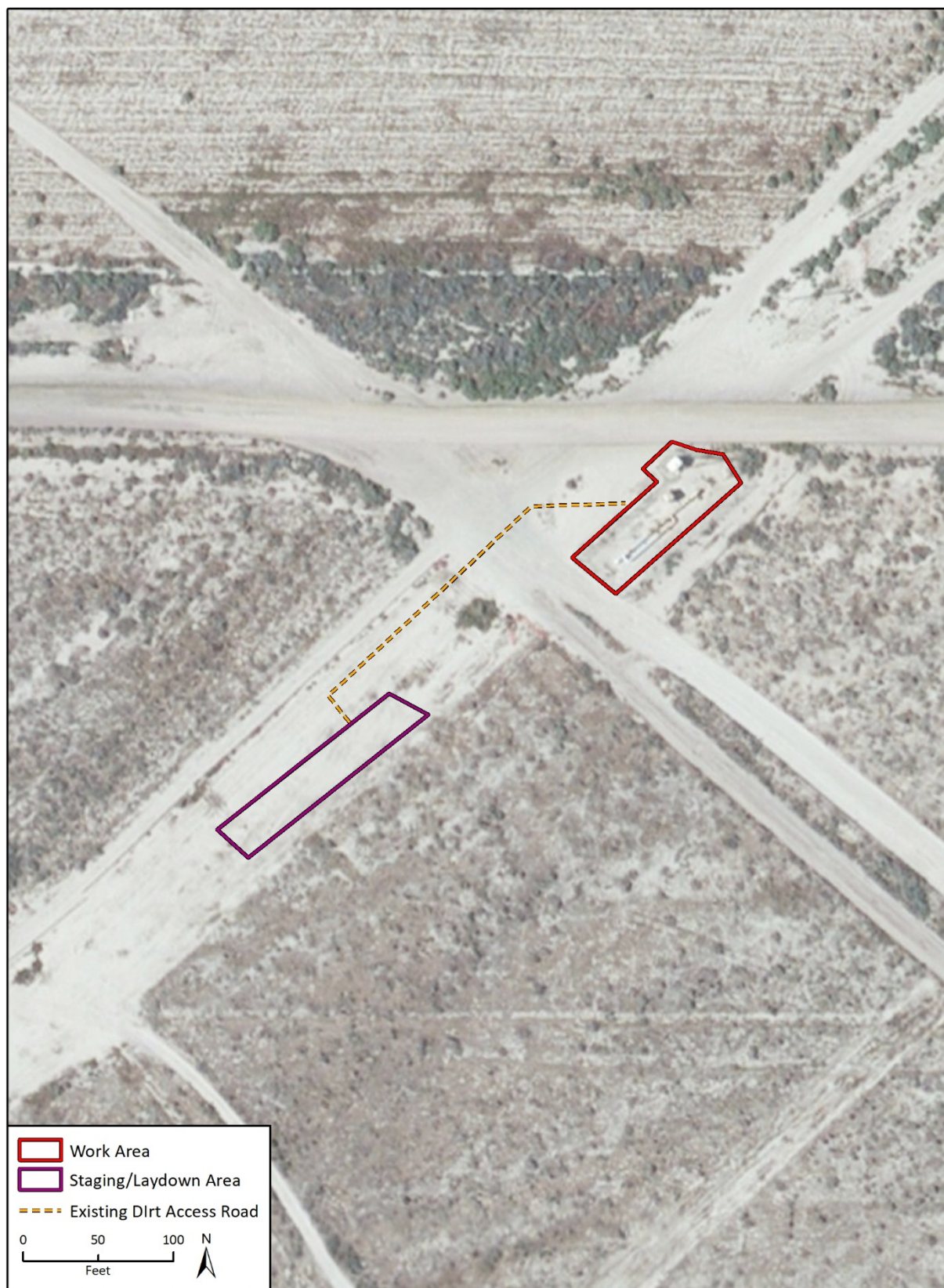
Figure 2 Project Location Detailed Map