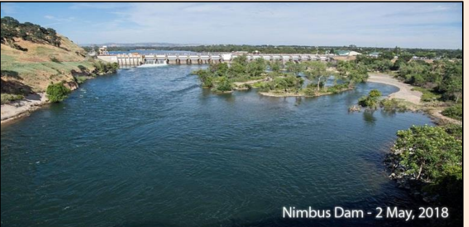
Nimbus Dam, American River