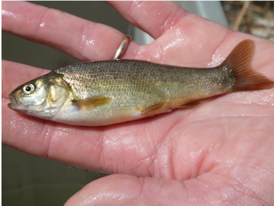
Owens Tui Chub from Upper Mule Spring, Inyo County.