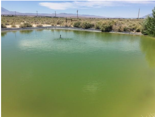
Figure 2g. White Mountain Research Center "Cottonwood Pond"

Figures 2a-g. Existing Owens Tui Chub habitats within its historic range.