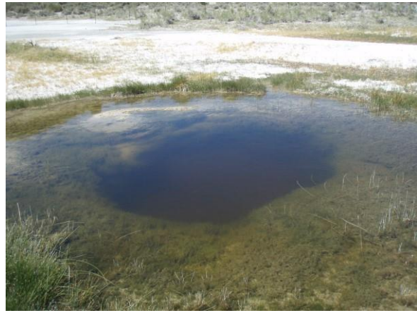
Figure 2f. Little Hot Creek pothole (blasted)