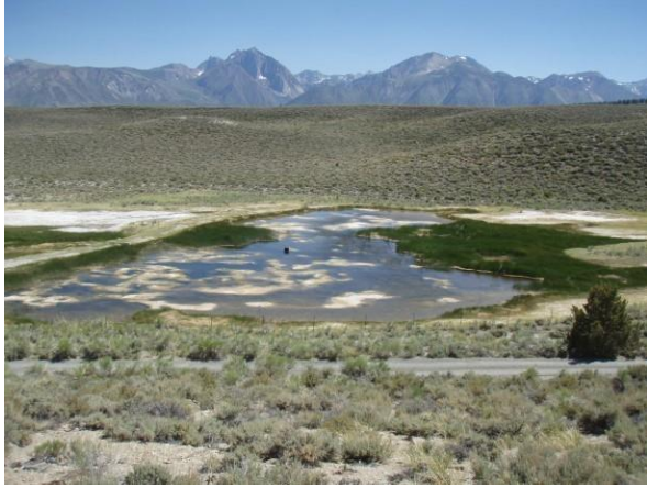
Figure 2e. Little Hot Creek Pond