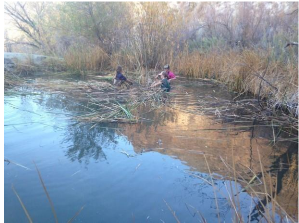
Figure 2b. Vegetation removal in Mule Spring