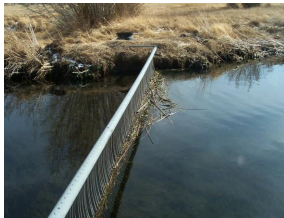
Figure 2d. Vegetation comb in CD Spring