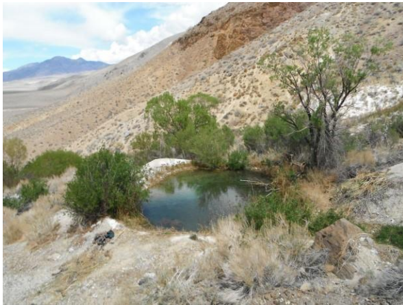
Figure 2a. Upper Mule Spring

The current distribution of genetically pure Owens Tui Chub is restricted to five, small, isolated sites within their historic range in the Owens Basin: Hot Creek headwaters (now limited to CD Spring), Little Hot Creek Pond, Upper Owens Gorge, Mule Spring, and White Mountain Research Center (WMRC), operated by the University of California (Figures 1 and 2a-g). A transplanted sixth population exists in Sotcher Lake, near Devil's Postpile National Monument, which is outside the historical range of the species, in Madera County (USFWS 2009) (Figures 1 and 3). While genetically pure Owens Tui Chub are very restricted and isolated in their distribution, hybridized Owens Tui Chub x introduced Lahontan Tui Chub are widespread in the Owens Basin, including in important climate change-resilient habitats (see the Climate Change subsection under Section V.A. - Threats and Survival Factors in this report). These habitats include Crowley Lake and the Upper Owens River; hybridized tui chub populations in these areas are the principal limitation to recovery and population expansion of non-introgressed Owens Tui Chub within their historic range (N. Buckmaster, CDFW, pers. comm., 2019).