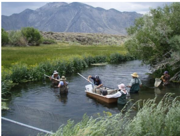
Figure 2c. Electrofishing CD Spring