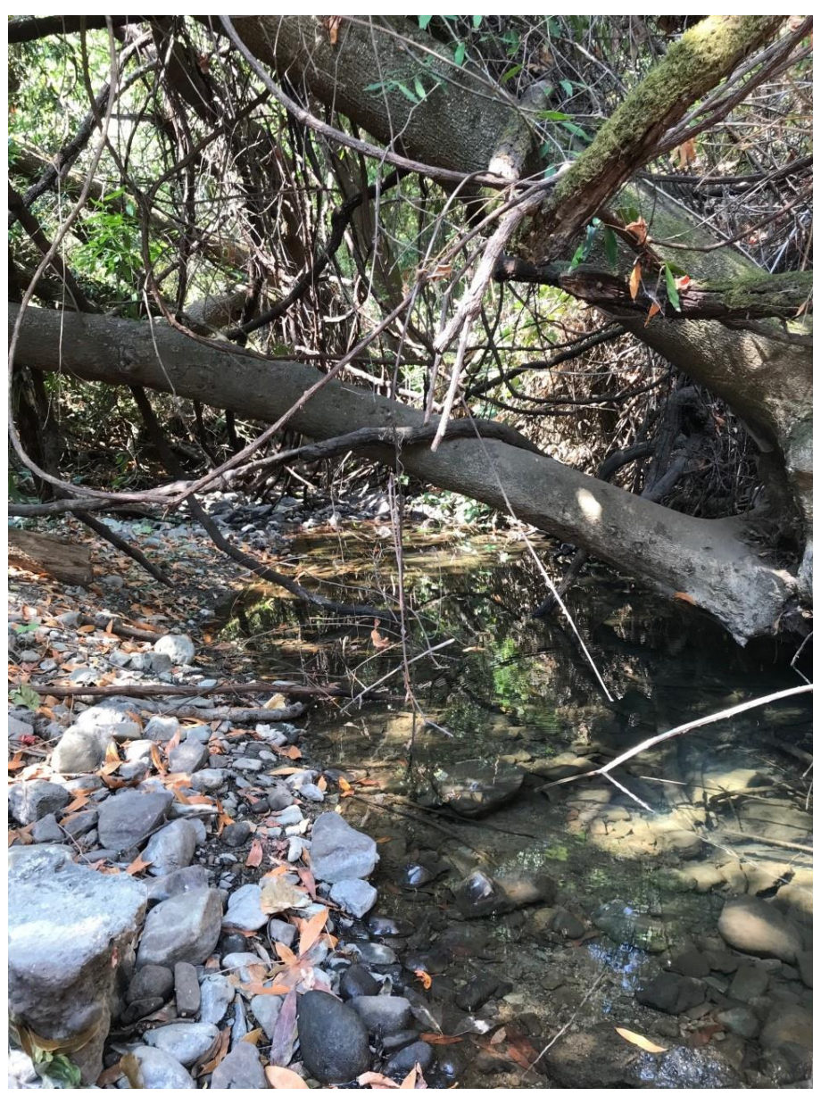
Suitable rearing habitat upstream of project reach