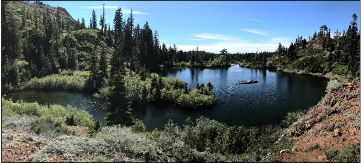
Figure 4. Overview panoramic photograph of View Lake, Nevada County facing north-east (CDFW, June 09, 2020).