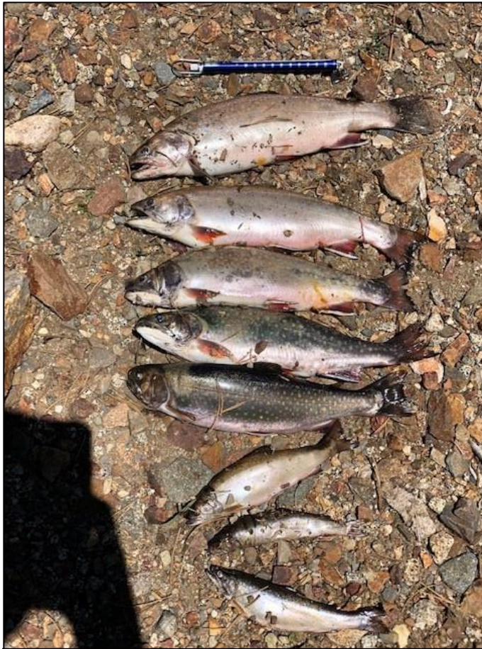
Figure 3. Photograph of Brook Trout captured in a gill net at View Lake, Nevada County (CDFW, June 10, 2020).

CDFW has planted View Lake with RT dating back to 1971 and most recently in 2018 ( Table 1 ). No RT were captured during the 2020 survey. If still extant in View Lake, RT are likely low density and may not persist without continued plants. Given that View Lake is likely an infrequently visited backpacking fishing destination, aerial plants are not recommended.