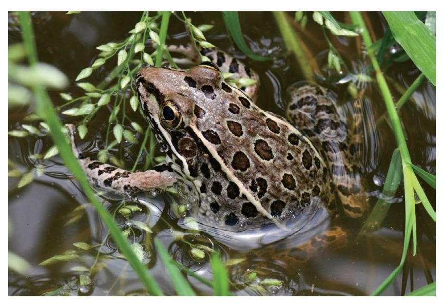
California Amphibian and Reptile Species of Special Concern (Thomson et al. 2016)