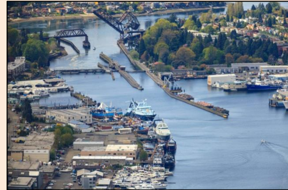
Ballard Locks, Salmon Bay – Washington Lake; fish ladder