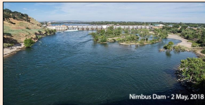
Nimbus Dam, American River