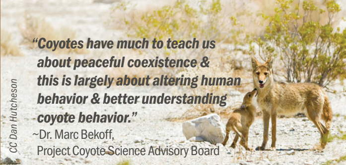
CC Dan Hutcheson

Help your neighborhood by sharing this brochure and by downloading the free resources available at www.ProjectCoyote.org/resources