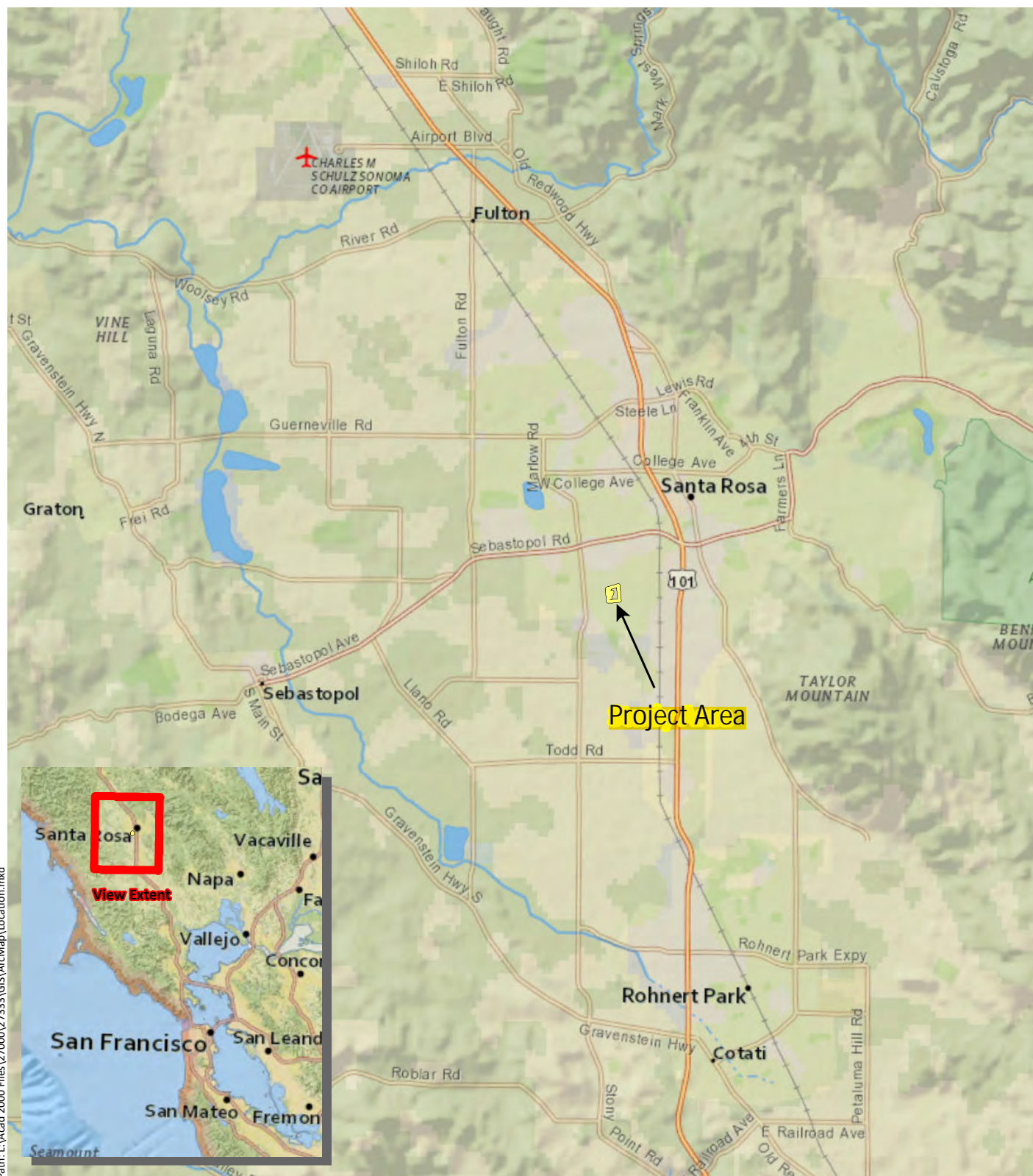
Figure 1. Project Area Location

Schellinger Santa Rosa Biological Resources Assessment Sonoma County, California