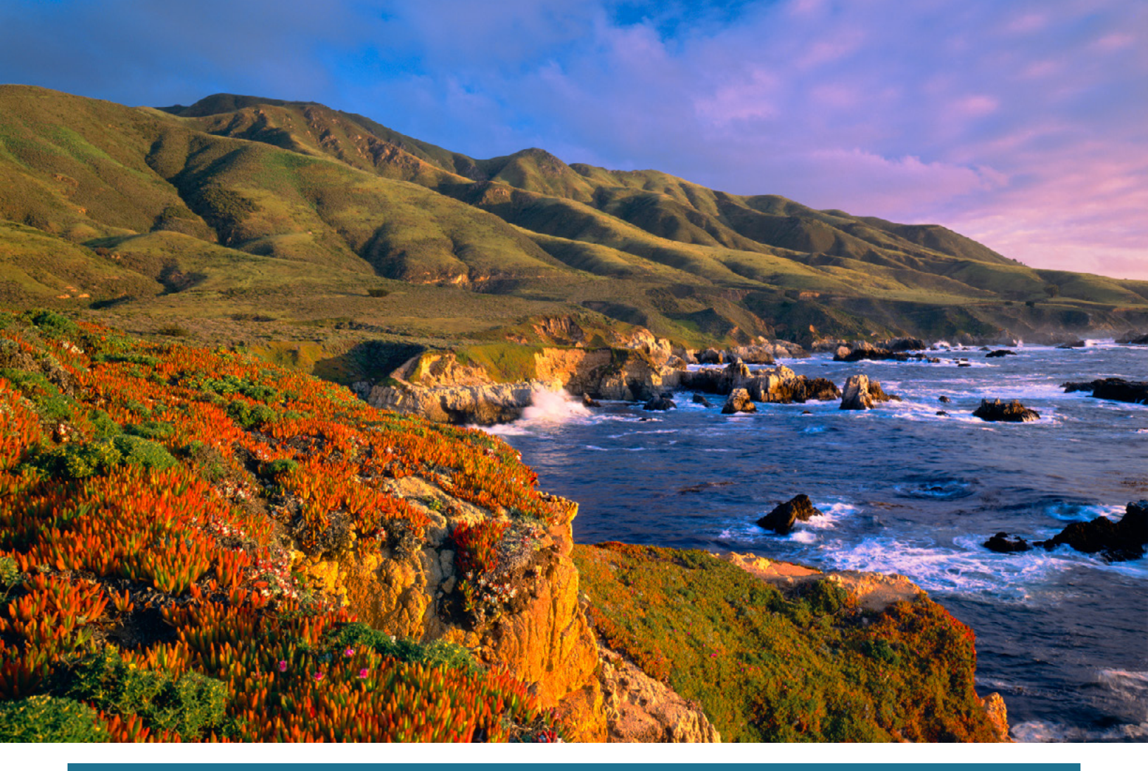
STRATEGY A3. Support participation of CDFW scientists in scientific training, mentorship, and professional exchange opportunities to ensure CDFW's scientific excellence, capacity, and quality.