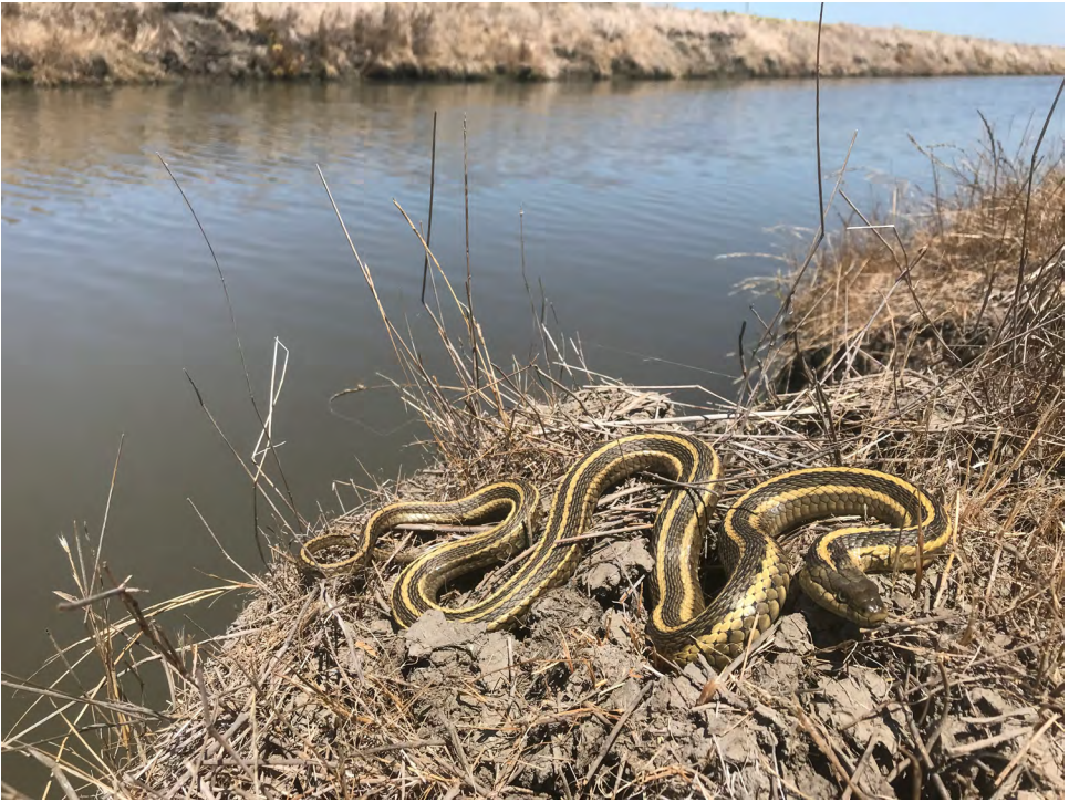
Figure 2. An adult giant gartersnake ( Thamnophis gigas ) next to a canal in habitat typical of the rice agricultural landscape in which most extant populations occur.

2020a), and wild giant gartersnakes also strongly select native treefrogs (Ersan et al. 2020b). Although bullfrog tadpoles and juveniles also are positively selected as prey (Ersan et al. 2020a, 2020b), adult bullfrogs are predators of small giant gartersnakes (Wylie et al. 2003).