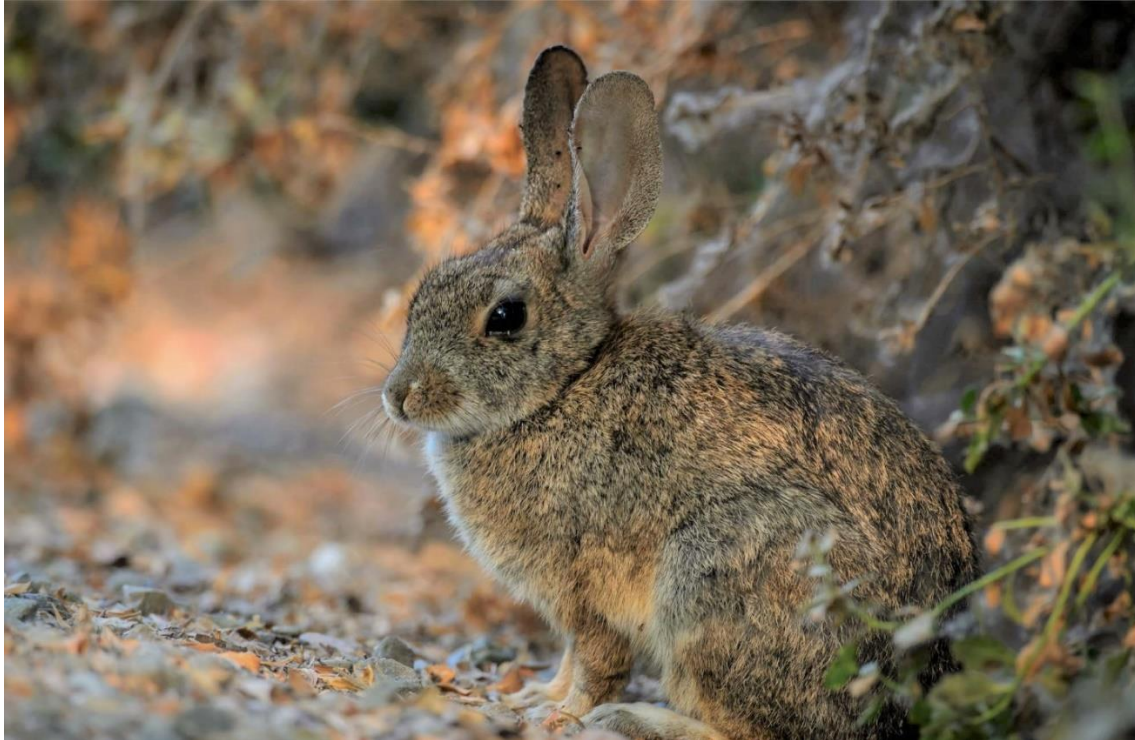
Endangered riparian brush rabbit.

In late summer 2020, an interagency conservation team including partners from the California Department of Fish & Wildlife, U.S. Fish & Wildlife Service, Oakland Zoo, River Partners, and the California State University Stanislaus Endangered Species Recovery Program implemented an emergency vaccination campaign on the San Joaquin River National Wildlife Refuge to protect endangered riparian brush rabbits from RHDV2. Nearly 500 wild riparian brush rabbits have been vaccinated since the campaign began and additional vaccination efforts are planned for fall 2021 with the goal of maintaining a vaccinated core of 200-300 riparian brush rabbits on the Refuge.