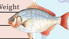
Amphistichus rhodoterus Max Length: 16