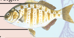
Amphistichus argenteus Max Length: 19 1/2