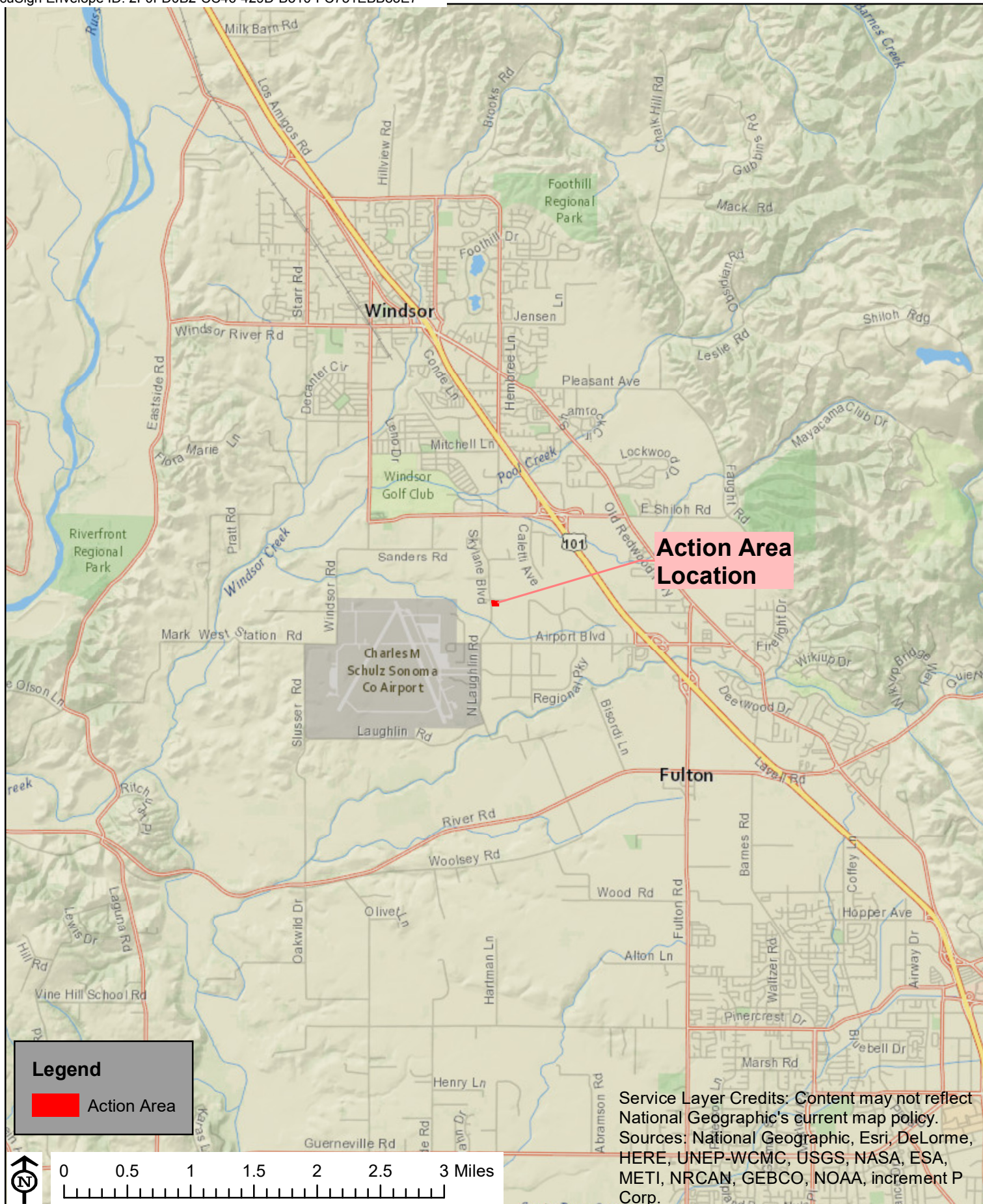
Figure 1. Location Map of Action Area

DenBeste Warehouse Project Santa Rosa, Sonoma County, CA