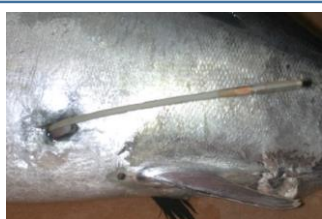
Archival tag in belly with stalk sticking out.

NOTE: All shipping costs will be paid for by NOAA