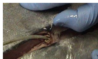
Tear tissue to open belly and expose tag.

Gently remove tag, it may be encased in tissue. Store it in a safe place.