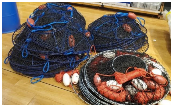
Figure 3. Examples of commercially available hoop nets. The net on the left (blue line) is an example of a Type B hoop net. The net on the right (red/orange line) is an example of a Type A hoop net.