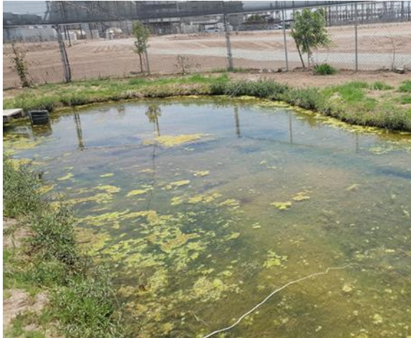
Figure 2a. Imperial Irrigation District refuge pond