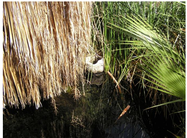
Figure 5b. Oasis Springs Ecological Reserve, Lower Pond

Vegetation control and removal are ongoing tasks required to maintain suitable Desert Pupfish habitat, both within the Dos Palmas ACEC, and elsewhere within their range. The Department, BLM, CNLM, the Southern Low Desert RCD, private property owners, and SDCWA have partnered to take a systematic approach to tamarisk control in the northern and western portions of the Salt Creek watershed. These efforts are intended to reduce habitat encroachment and water loss through transpiration. BLM is removing tamarisk in the Salt Creek watershed and the Department has completed limited control activities in the Oasis Springs Ecological Reserve. Department staff also assisted BLM in applying for, and