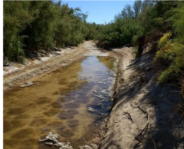
Figure 2b. San Felipe Creek, Partially dessicated (summer 2019).