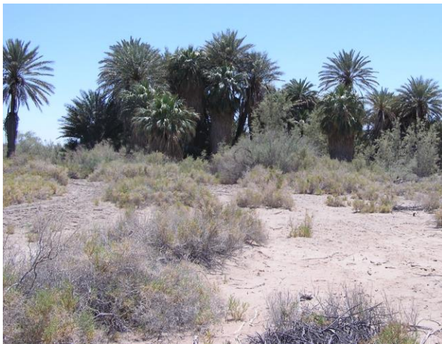
Figure 5a. Oasis Springs Ecological Reserve, Lower Oasis

In Upper Salt Creek (see Figure 1 for general location), the SDCWA manages instream flow to maintain a surface outflow, which provides Desert Pupfish habitat. These flows are part of the SDCWA's required mitigation for the Coachella Canal Lining Project (SDCWA 2019). Historically, the average volume of outflow water required to create surface flow in the steambled has been approximately 623 acre-feet per year (SDCWA 2019). However, in recent years, as much as 4,850 acre-feet per year have been required (S. Keeney, CDFW, pers. comm. 2020). This large disparity likely speaks to reduced aquifer groundwater recharge in the basin, coupled with increasing temperatures and associated landscape-level changes, creating the need for more water to achieve past flow levels and provide required habitat. Given the importance of this artificially sustained stream habitat, CVWD and Department staff regularly monitor water quality and flows in upper Salt Creek to inform ongoing and adaptive management of water releases. A monitoring network of wells, piezometers, and gages has also been installed to monitor groundwater recharge and surface flows in the Core Marsh and Main Drain Hydrological areas (SDCWA 2019).