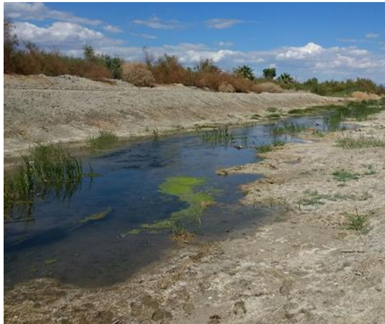
Figure 3. A typical Salton Sea irrigation drain, representing much of the Desert Pupfish's remaining available habitat (aside from a few natural streams and mostly artificial refuges), all of which require ongoing human intervention, management, and maintenance. Populations of Desert Pupfish in irrigation outflow drains are particularly vulnerable to abrupt habitat dessication, due to agricultural irrigation reductions or other outflow modifications, as well as ongoing threats from agricultural effluents and other pollutants and resulting poor water quality.

Decreases in agricultural outflows, associated with the QSA, will also likely impact Desert Pupfish, and perhaps other fishes and aquatic organisms in these habitats, via reduced surface flows and associated increased water quality impairment in agricultural drains they occupy (Figure 3). For example, selenium levels are projected to increase within Salton Sea irrigation drains, which could lead to reduced egg viability, increased mortality of larval Desert Pupfish, and increased vulnerability to pathogens (S. Keeney, CDFW, pers. comm. 2020). In addition, increased salinity associated with lake level reduction will presumably exclude Desert Pupfish from utilizing the majority of the Salton Sea itself, likely leading to further reduction in gene flow between populations (USFWS 2002). As mentioned in Moyle (2002), if remaining natural populations of Desert Pupfish remain largely reliant upon agricultural irrigation outflows, which are often unreliable in both quantity and quality, their status is not likely to improve.