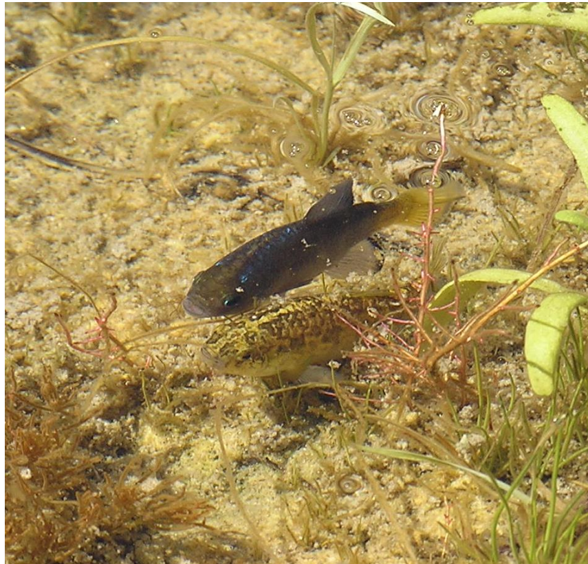
Desert Pupfish male and female pair.