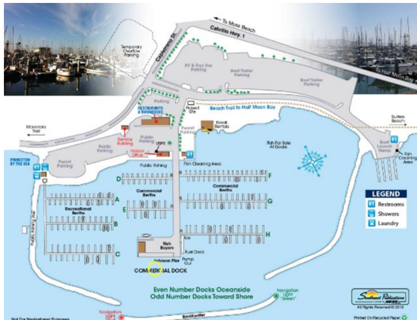
Attachment 1: Pillar Point Harbor net pen location. Yellow circle indicates approximate net pen site. Release after acclimation will be in outer harbor.