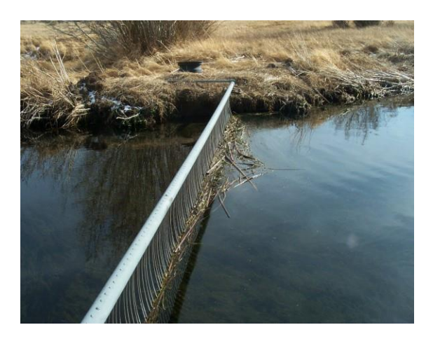
Figure 2d. Vegetation comb in CD Spring