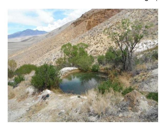
Figure 2a. Upper Mule Spring

The current distribution of genetically pure Owens Tui Chub is restricted to five, small, isolated sites within their historic range in the Owens Basin: Hot Creek headwaters (now limited to CD Spring), Little Hot Creek Pond, Upper Owens Gorge, Mule Spring, and White Mountain Research Center (WMRC), operated by the University of California (Figures 1 and 2a-g). A transplanted sixth population exists in Sotcher Lake, near Devil's Postpile National Monument, which is outside the historical range of the species, in Madera County (USFWS 2009) (Figures 1 and 3). While genetically pure Owens Tui Chub are very restricted and isolated in their distribution, hybridized Owens Tui Chub x introduced Lahontan Tui Chub are widespread in the Owens Basin, including in important climate change-resilient habitats (see the Climate Change subsection under Section V.A. - Threats and Survival Factors in this report). These habitats include Crowley Lake and the Upper Owens River; hybridized tui chub populations in these areas are the principal limitation to recovery and population expansion of non-introgressed Owens Tui Chub within their historic range (N. Buckmaster, CDFW, pers. comm., 2019).