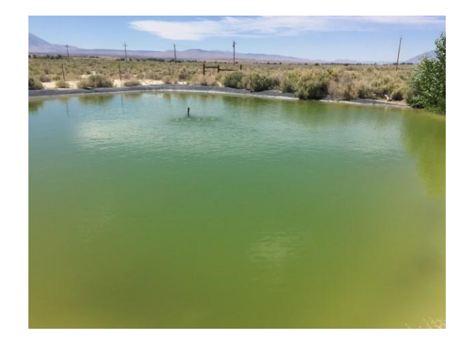
Figure 2g. White Mountain Research Center "Cottonwood Pond"