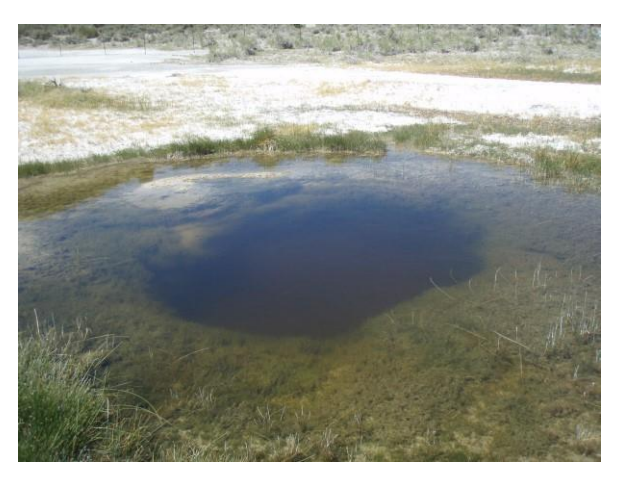
Figure 2f. Little Hot Creek pothole (blasted)