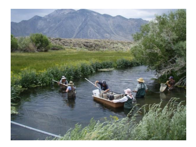
Figure 2c. Electrofishing CD Spring