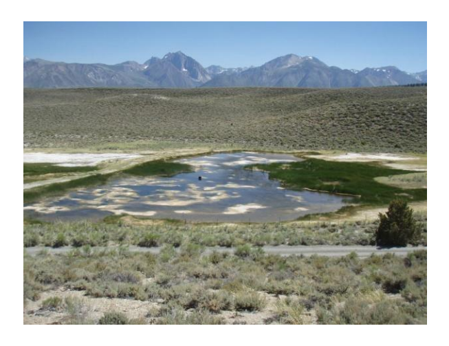
Figure 2e. Little Hot Creek Pond