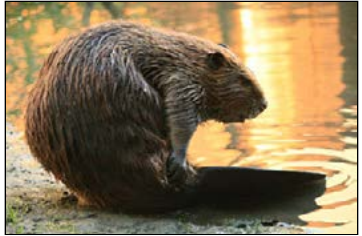
Figure 1.

The American Beaver ( Castor canadensis ) is the largest living rodent in North America, with adults averaging 40 pounds in weight and measuring more than 3 feet in length, including the tail. These semi-aquatic mammals have webbed hind feet, large incisor teeth, and a broad, flat tail (Figures 1 and 2).