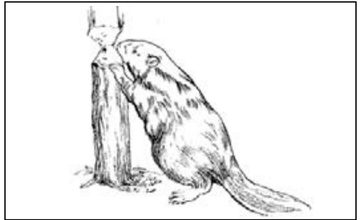
Figure 3. A beaver uses its tail as a prop in order to sit upright. (Miller and Yarrow 1994)

Beavers are well known for their construction efforts. They create dams and lodges for shelter and protection, largely with woody material. The woody material used in construction is either gathered from the ground locally, or from small and medium sized trees that the beavers fell with their teeth (Figures 4 and 5). The orange tooth enamel of their incisors is thicker on the front than the back, allowing for a self-sharpening wear pattern that maintains their chisel-like edge.