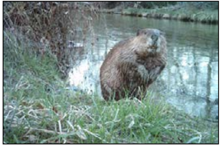
Figure 2. Beaver at French Creek, Siskiyou County.

Look for signs of beavers during the day; look for the animals themselves before sunset or sunrise. Approach a beaver site slowly and downwind. (Beavers have poor eyesight but excellent hearing and sense of smell.) Look for a V-shaped series of ripples on the surface of calm water. A closer view with binoculars may reveal the nostrils, eyes, and ears of a beaver swimming.