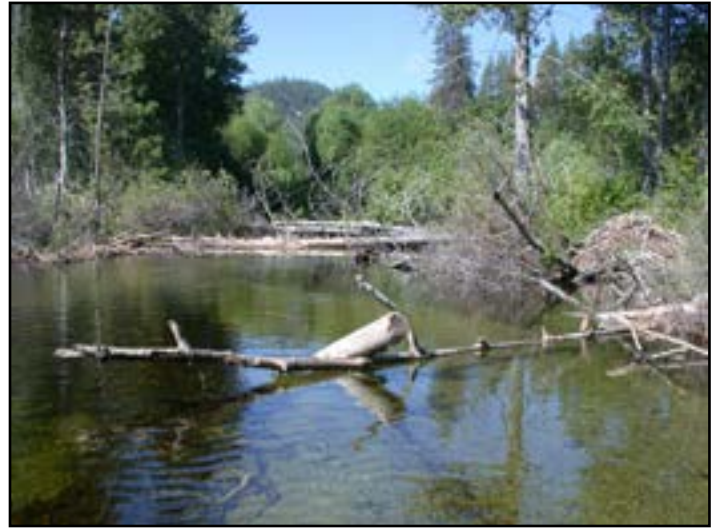
Figure 5: Beaver pond and lodge on Sugar Creek, Siskiyou County.

frequent beaver ponds to forage on shrubby plants that grow where beavers cut down trees for food or for use in constructing their dams and lodges. Weasels, raccoons, and herons hunt frogs and other prey along the marshy edges of beaver ponds. Sensitive species such as red-legged, yellow-legged and Cascade frogs all benefit from habitat created by beaver wetlands. Migratory water birds use beaver ponds as nesting areas and resting stops during migration. Ducks and geese often nest on top of beaver lodges since they offer warmth and protection, especially when lodges are formed in the middle of a pond. Willow flycatchers use the shrubby re-growth of chewed willow stumps to seek shelter and find food. The trees that die as a result of rising water levels attract insects, which in turn feed woodpeckers, whose holes later provide homes for other wildlife. In coastal rivers and streams, young coho salmon and steelhead may use beaver ponds to find food and protection from high flows and predators while waiting to grow big enough to go out to sea (Pollock et al. 2003).