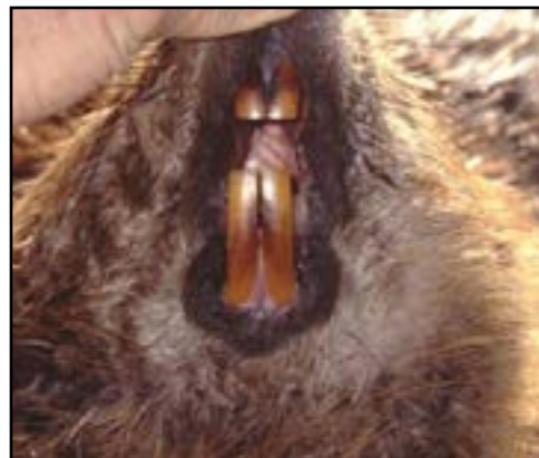
Figure 4. Beavers have self-sharpening incisors.

Depending on the type of water body and local habitat conditions, beavers may also construct burrows in the bank of a stream or river. These bank dens may be used in lieu of, or in conjunction with a lodge (Figure 5) and often take advantage of natural features such as logs or stumps.