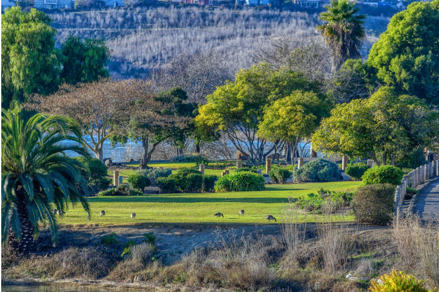
Benicia shoreline park overlooking Southampton Bay