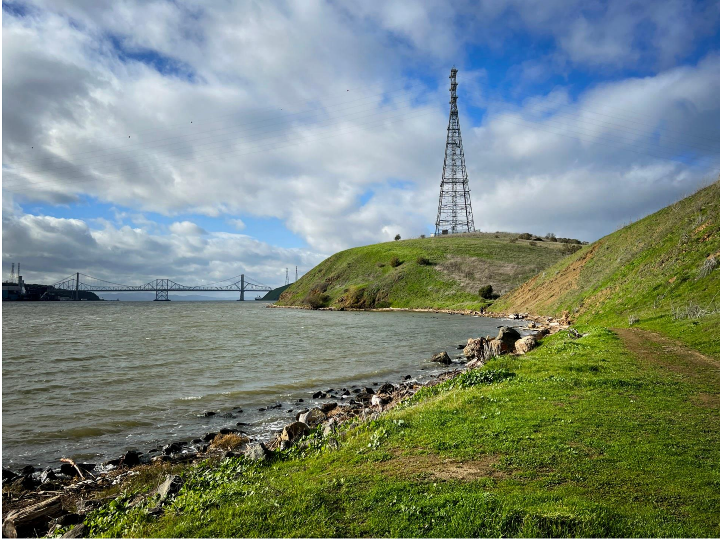
Southampton Bay- Benicia State Park