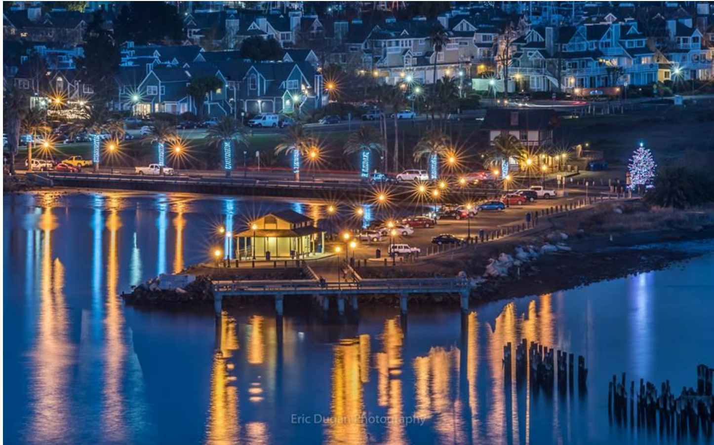
Downtown Benicia at night