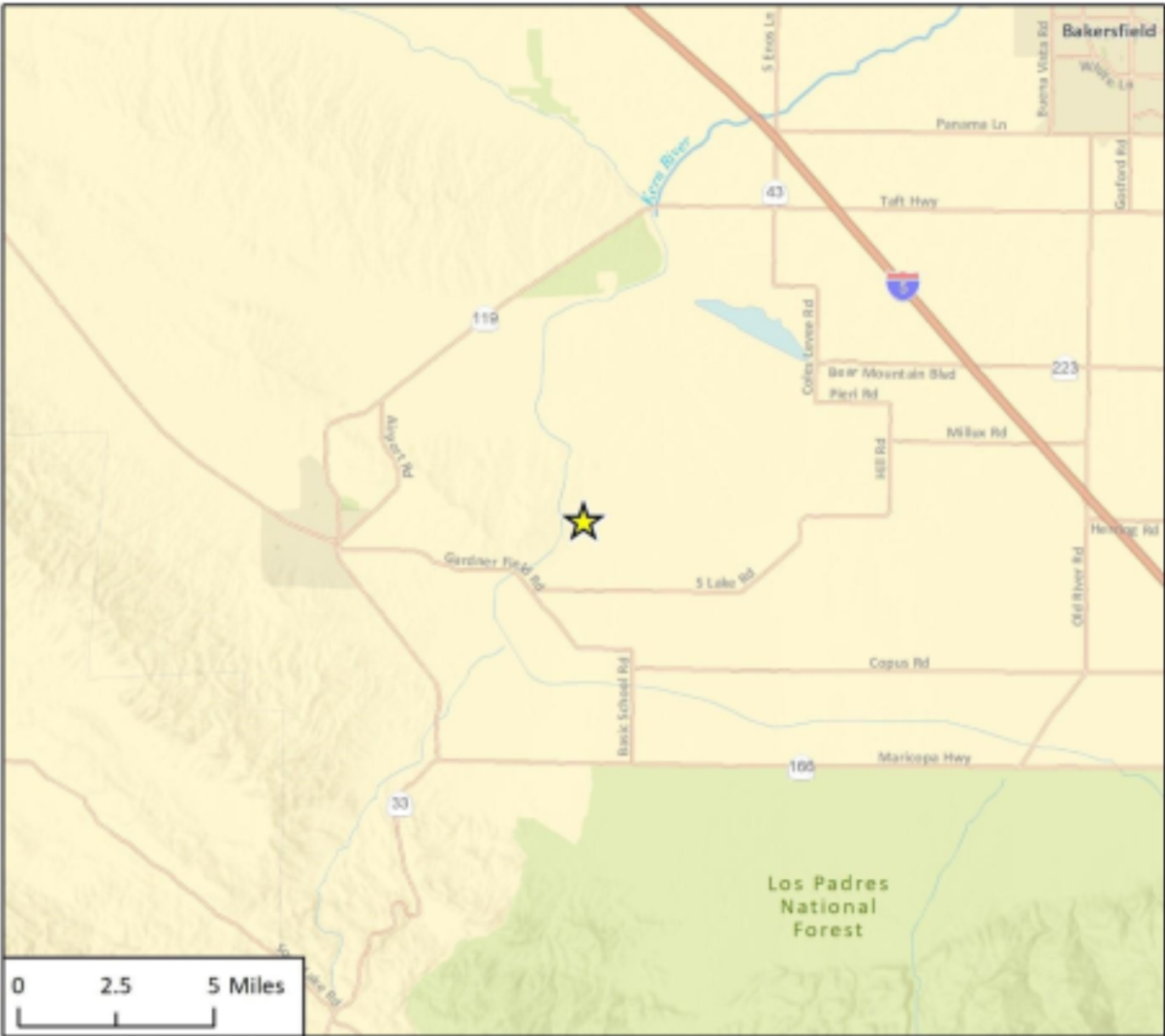
Figure 1 Regional Location