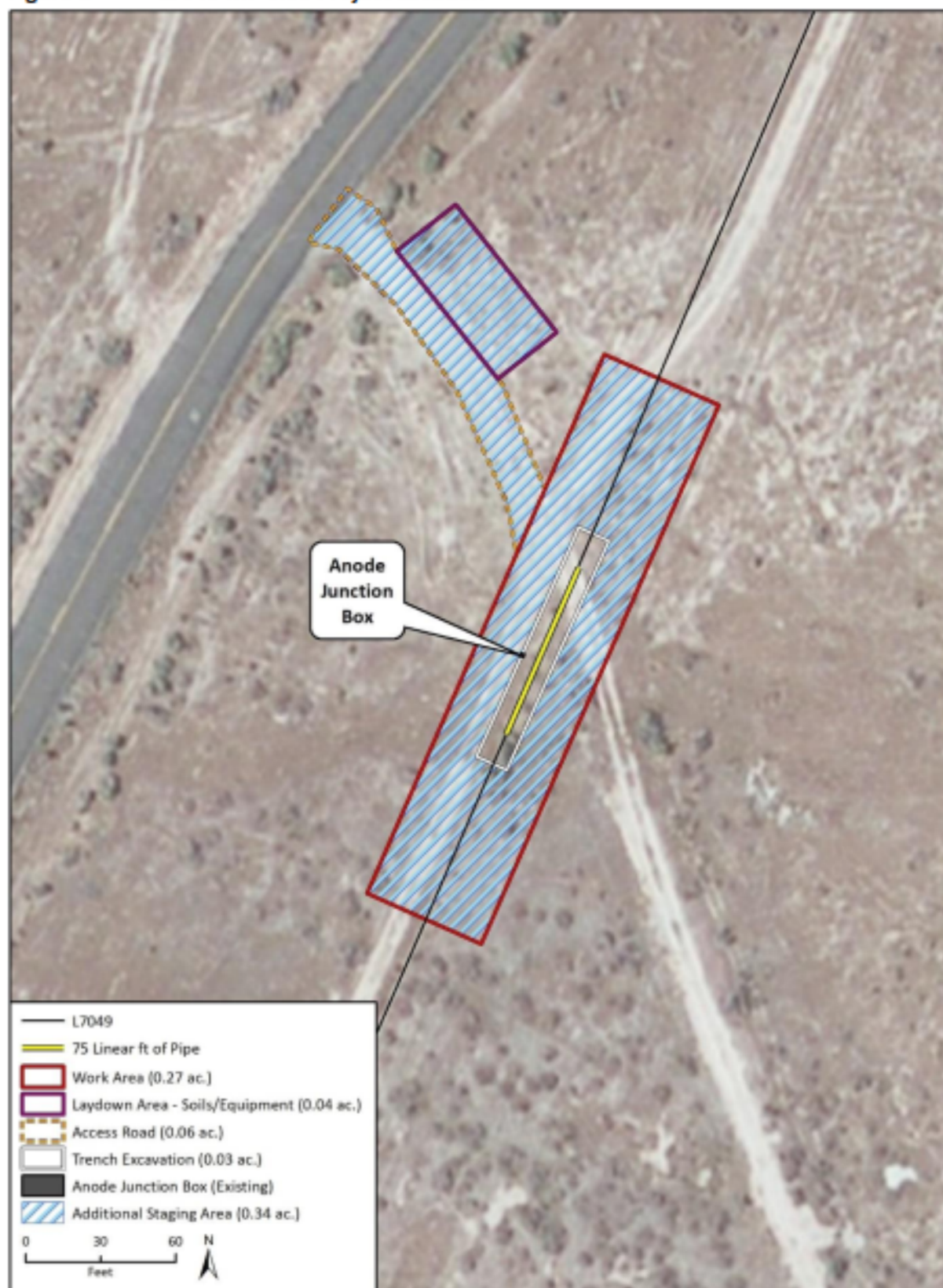
Figure 2 L7049 MP 0.38 Project Location

Imagery provided by Esri and its licensors © 2022.