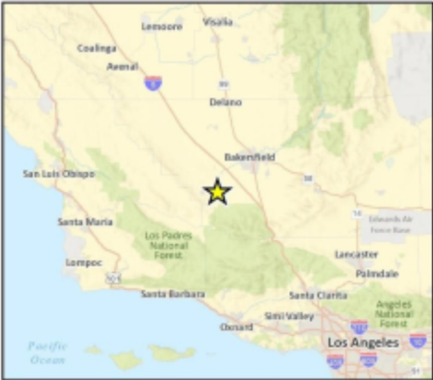
Fig. 1 Regional Location