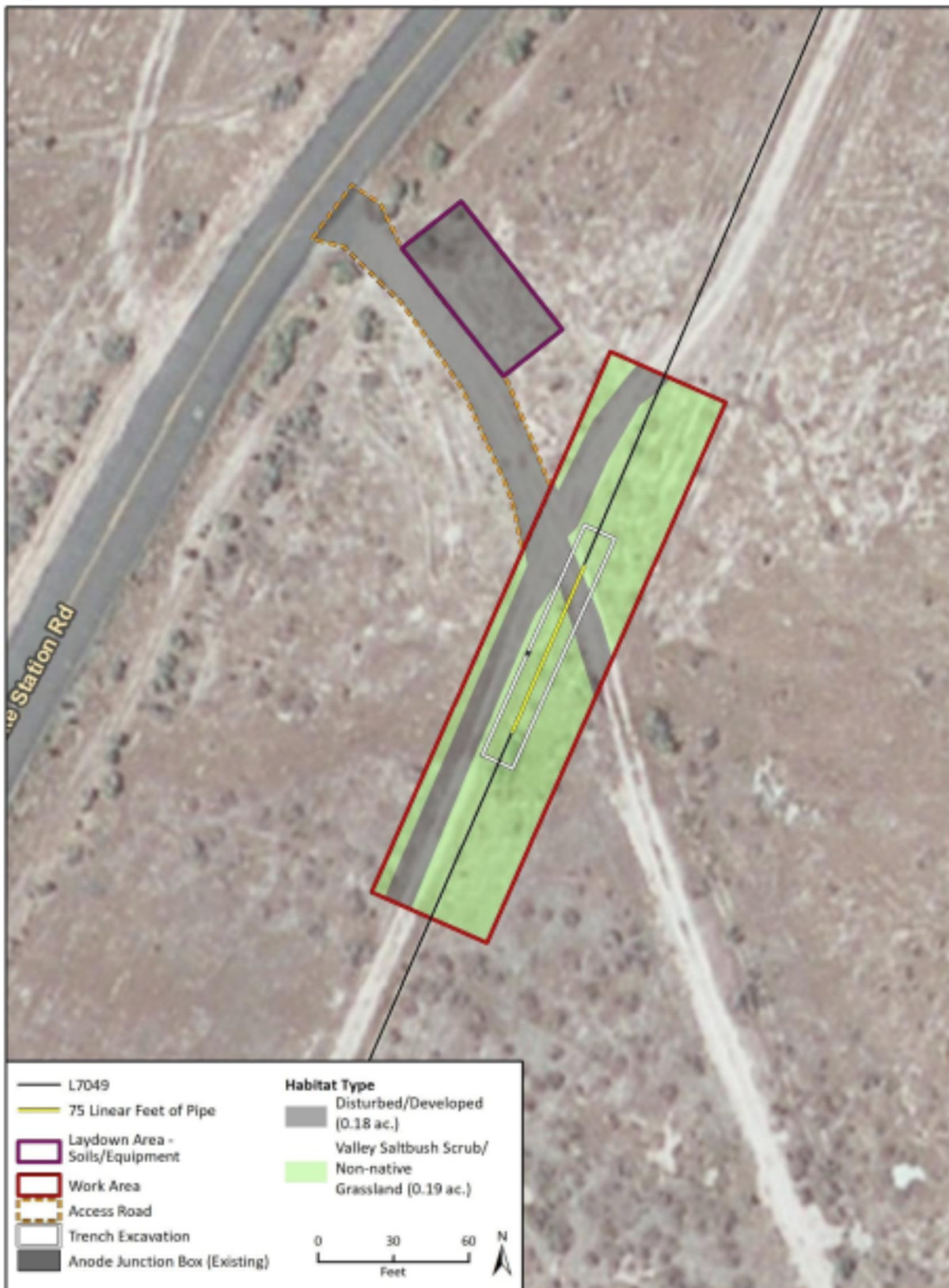
Figure 3 L7049 MP 0.38 Habitat Map