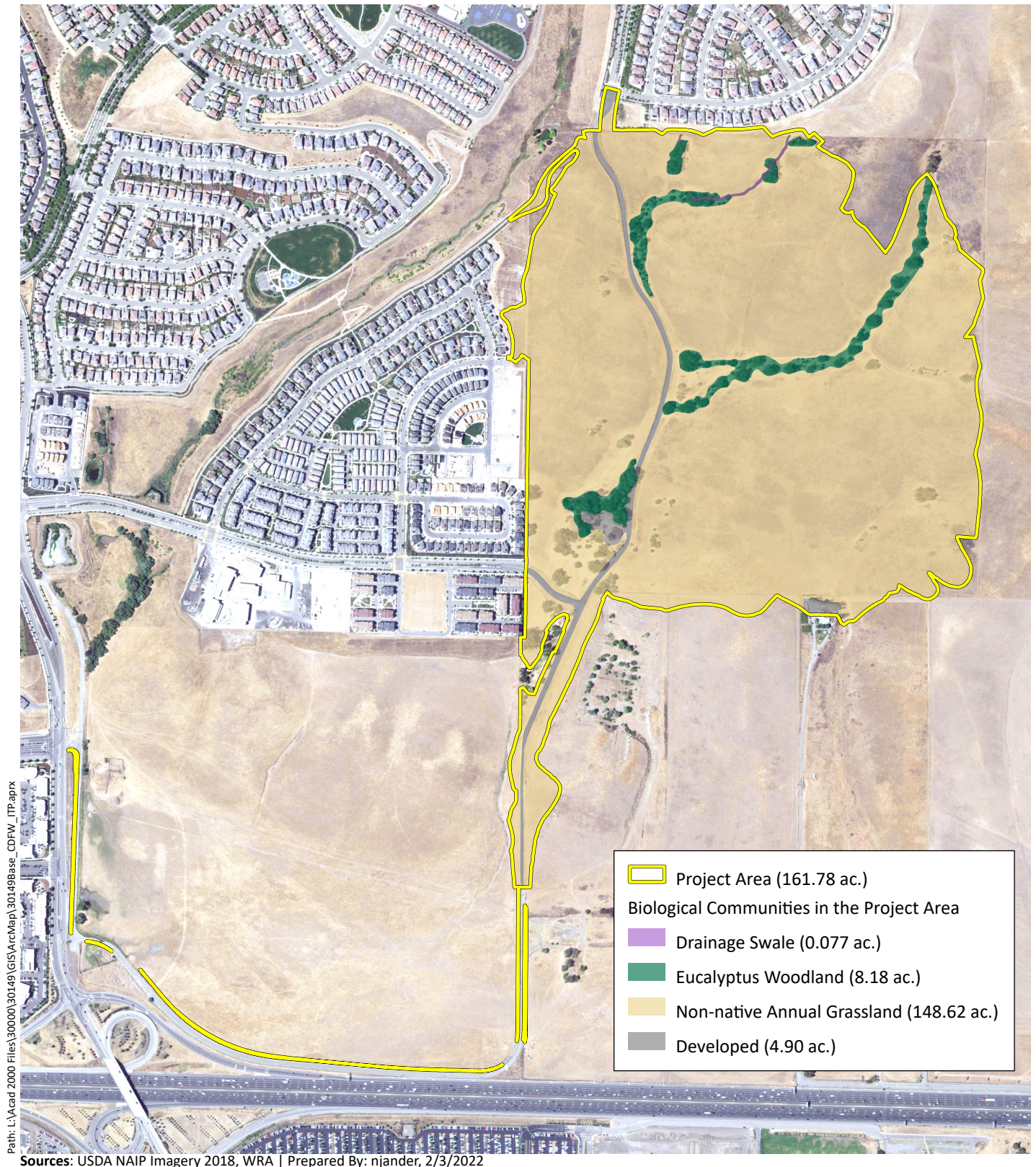
Figure 2 Biological Communities in the Project Area

California Incidental Take Permit Application East Ranch (Croak) Development Project 4038 Croak Road, Dublin, California